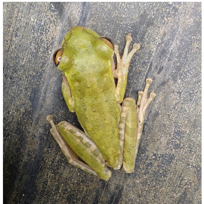
Fig. 1. Cuban Treefrog, Osteopilus septentrionalis (UF-Herpetology 174216), collected on 9 December 2013 at a shipping port in Saint George's Harbour, Grenada Island, Grenada.

Both the Woodslave, Hemidactylus mabouia (Moreau de Jonnès 1818), and Brown Anole, Anolis sagrei Duméril and Bibron 1837, are established on Grenada. Hemidactylus