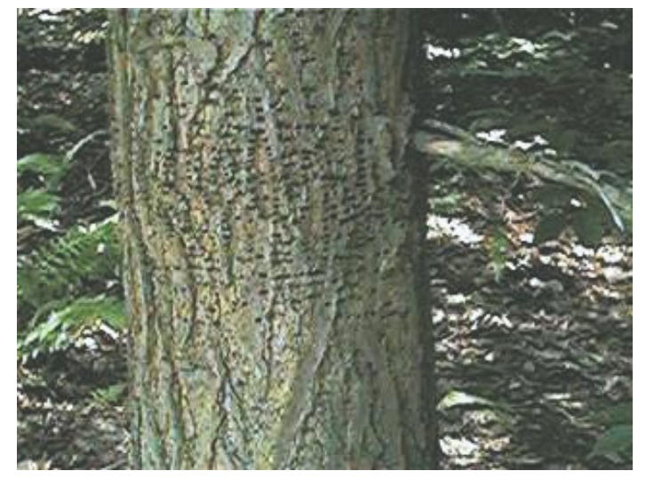
Typical horizontal row of holes made by a yellow-bellied sapsucker.

The yellow-bellied sapsucker feeds on tree sap that oozes from horizontal rows of small holes that it drills into tree