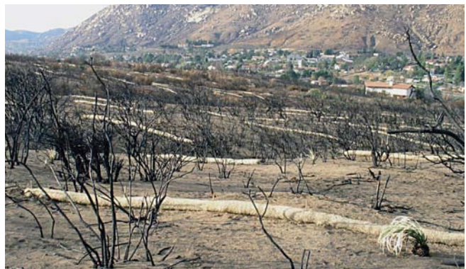
On a burned hillslope in southern California, straw wattles were installed in a staggered layout.

Combinations of treatments can take advantage of a single application process to achieve multiple goals; for example, seed is often mixed into dry or wet mulches. Combination treatments, however, can be costly. In some cases though, the expense of multiple treatments and/or treatment maintenance may be justified if a resource at risk has a very high value. This was the case after the 2002 Missionary Ridge Fire in Colorado, which placed the intake structure of a dam at risk of sedimentation. The reservoir above the dam provides water for the city of Durango. In this case, contour-felled logs, straw mulch, hand seeding, and straw bale check dams and debris racks were all implemented at higher than normal rates. In addition, the hillslope and channel barriers were cleaned out and maintained after individual storms.