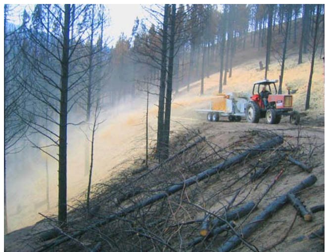
After the 2007 Cascade Complex Fires in Idaho, a trailer-mounted blower pulled by a tractor applies straw mulch as postfire treatment down slope from a road.

Dry mulches—straw, wood strands, and wood shreds generally outperform other treatments in reducing postfire hillslope erosion. They provide immediate ground cover, trap sediment, and have reduced erosion rates by up to 90 percent or more. Wood strand mulches stay in place longer than straw