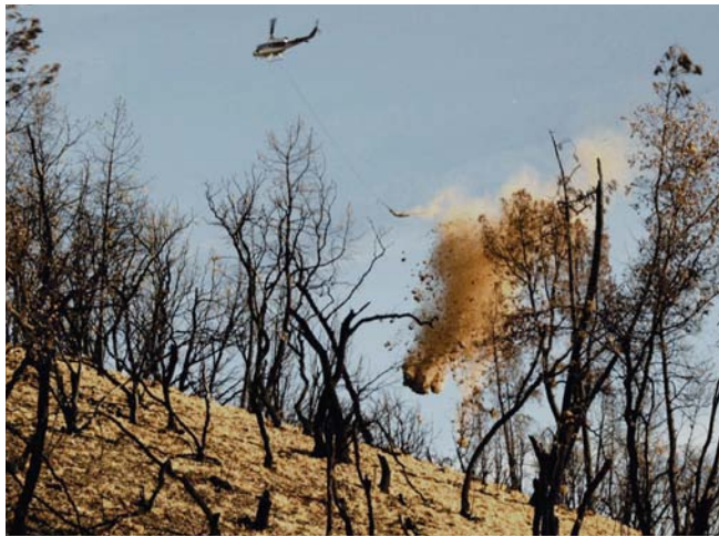
An aerial application of straw mulch treatment is released over the target area by a cargo net suspended below a helicopter.

mulches because of their greater resistance to wind displacement. Both straw and wood mulches can be applied aerially, an important advantage when large, areas in remote areas require treatment.