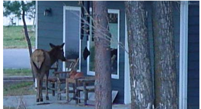
Wildlife everywhere have been impatiently waiting for the election results. This elk was seen in Estes Park, Colorado, trying to catch the election results on CNN.

A special thank you, also, to departing Board Members for their service to the Working Group.