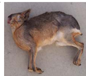
Argentinean hare found in Indiana.

A couple of months back the Indiana Wildlife Conflicts received a call about a strange looking animal. The call sounded like a bad joke: A squirrel, a rabbit, and a deer walk into a bar.... Anyway, the caller described an animal that resembled a cross between those three animals. Our initial reaction was that the caller must have misplaced their glasses. We asked if they had a photo and it turns out they did. It was an Argentinean hare that was probably an escaped pet. Unfortunately, this was not the first instance of these guys in Indiana. Several years ago, the DNR received a similar call and received the same type of photo. I guess wildlife biologists involved with invasive species can feel secure in their job.