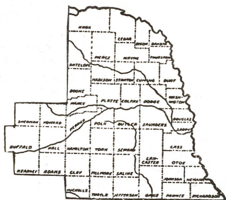
COUNTIES ELIGIBLE UNDER 9c