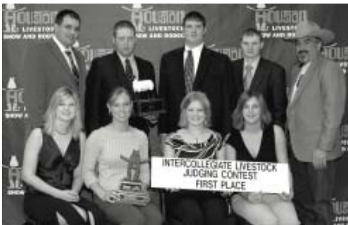
2005 Livestock Judging Team

With each outing, our current UNL team gains experience and the students become more competitive. It's easy to understand why these students and their coaches are excited about the upcoming fall judging season! The UNL Livestock Judging