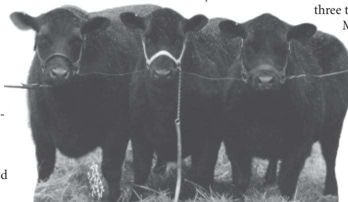
Champion Angus Herd in the 1926 National Western Stock Show, Denver exhibited by the University of Nebraska. All sired by Kenyon 3rd. The steer on the left is College Kenyon who was also named Champion Live and Champion Carcass steer.