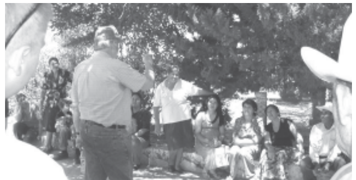
Students learn about life in a rural ejido village.