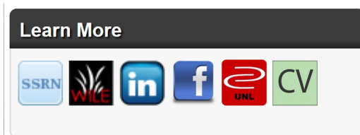
Figure 3. Faculty page buttons for SSRN, WILE, LinkedIn, Facebook, UNL Digital Commons and Curriculum Vitae.

tons or using recognized buttons to link our faculty and librarians with those options. The recently added “CV” button is a good example of creating a button to fit a specific request: Several faculty members wanted a link to their curriculum vitae (CV) from their Law College faculty Web page (see Figure 3). While LinkedIn has become the professional networking and online resume option for many people, it does not include profile sections for service and committee work that many professors and librarians participate in. Including the CV button on a faculty member’s Web page provides access to their current CV for interested visitors or those not using LinkedIn.