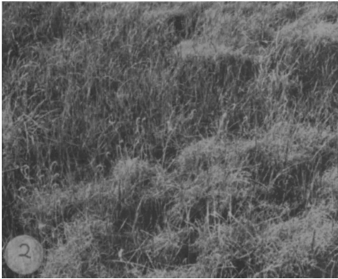
FIG. 2. Bouteloua gracilis (light color) spreading in Andropogon scoparius prairie. Photo. Lincoln, Nebr., April 29, 1939.

were adequate, the cover was open, perennial grasses were at their lowest ebb, and millions of seeds of all classes of annuals were present. Festuca octoflora , a native annual grass, was so abundant and increased so much that it was necessary to abandon the stem-count method and estimate its change by the number of square decimeter units of observation in which it was found each year. On that basis it increased from 1,700 to 2,800 and then to 3,200 square decimeters during the first three years, the gain being