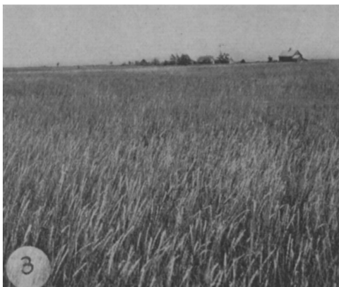
FIG. 3. Portion of a bluestem prairie at Carleton, Nebr., where the former grasses have been almost completely replaced since 1934 by western wheat grass. Note the paucity of forbs. Photo. June 15, 1938.

were adequate, the cover was open, perennial grasses were at their lowest ebb, and millions of seeds of all classes of annuals were present. Festuca octoflora , a native annual grass, was so abundant and increased so much that it was necessary to abandon the stem-count method and estimate its change by the number of square decimeter units of observation in which it was found each year. On that basis it increased from 1,700 to 2,800 and then to 3,200 square decimeters during the first three years, the gain being