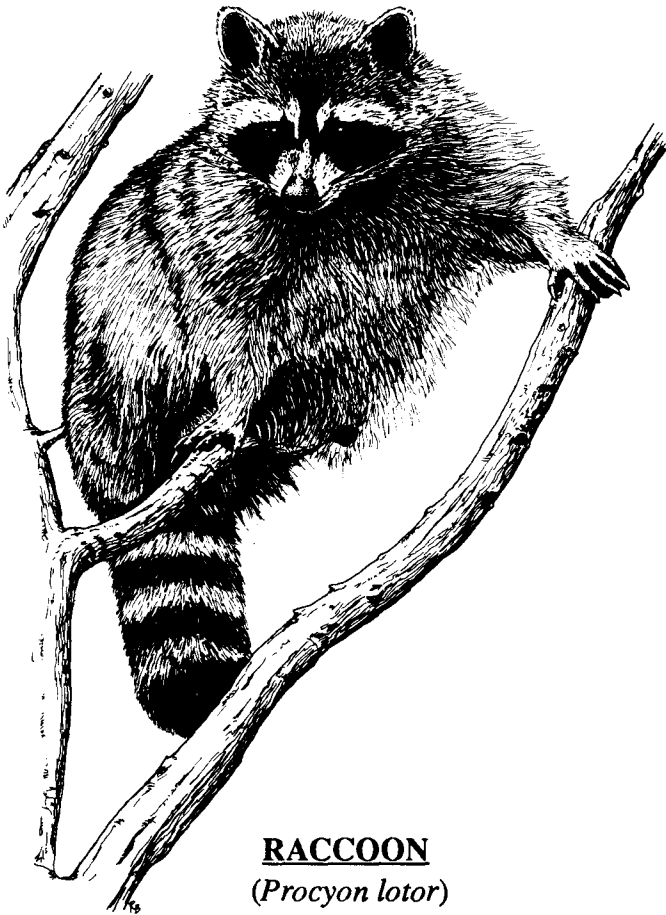
RACCOON ( Procyon lotor )

Description: The common name "raccoon" comes from the Indian word "arakum" or "aracoun," meaning "he scratches with his hands." Adult raccoons may be up to 3 feet long and weigh up to 30 pounds. They have a black face mask and ringed tail. Their fur is long and dense, a grizzled brown and black color that has often been described as "salt and pepper." Although raccoons are flesh-eaters and have long canine teeth, their molar teeth are adapted for a varied diet which includes more than just meat. The raccoon's closest relatives are ringtails and coatis from the Southwest.