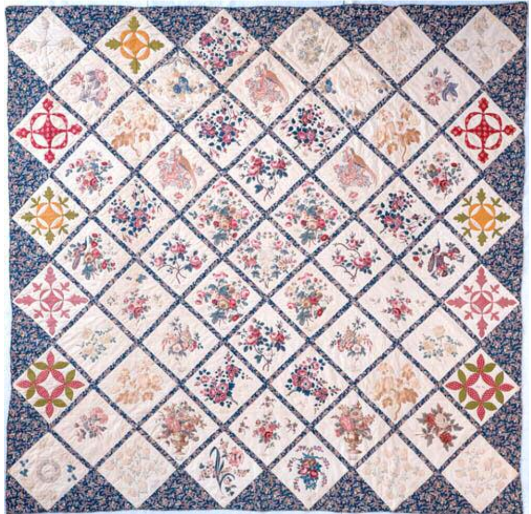
Floral Album. 107" x 105.5"

The University of Nebraska–Lincoln Department of Textiles, Clothing & Design and the IQSC jointly sponsor a master's degree program in textile history and quilt studies. For more information go to http://www.quiltstudy.org/index.html then click on Education and Research.