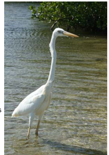
Does anyone know where the WDMWG meeting room is?

ing topics available, there were many 'conflicts' with my agenda (I used the online agenda builder this year!) as I found myself 'double-booked' and having to make decisions as to which of these great talks to attend. The WDM Working Group plans to continue this trend of providing topics in their subject area by proposing 2 symposia for the 2009 TWS conference in Monterey: T&E species and Non-lethal methods to manage wildlife.