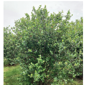
Figure 2. Mature black chokeberry at Native 32 Winery

August. Its growth originates from the crown, and it does not sucker aggressively, which many homeowners may appreciate. There are both landscaping and fruit production cultivars available, but all Aronia have shiny dark green leaves, white umbels of flowers, and bright red fall foliage, plus it has good resistance to pests and diseases compared to many other fruit-bearing species (Wiederholt, 2007). Black chokeberries are smaller than red chokeberries, with an average height ranging from 4 to 8 feet (Figure 2). Black chokeberry flowers are late enough in the spring to avoid spring frost damage to its flowers. Some black chokeberries have larger fruit with a less bitter, more flavorful taste. Once ripe, berries can be harvested, or left on the shrub for wildlife and winter interest. If not first eaten by birds and other wildlife, the berries will eventually drop off. This species can be found throughout its native range in the Northeast and Midwest, as well as eastern Canada, in both damp/wet and dry soils. Among the cultivars of black