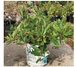
Figure 3. 'Ground Hog' Plant

Aronia is a durable plant in most locations; however, its placement and use may encourage unwanted disease and pest pressures. Other fruits in the Rosaceae family, such as apples and pears, have the same insects and diseases that attack Aronia . Sometimes birds, deer, and other wildlife will eat the berries, but the astringency typically discourages continued predation (Wilson & Beekman, 2018). The following sections are on insects and diseases that are potential problems for Aronia , with recommendations on how to prevent and treat if necessary.