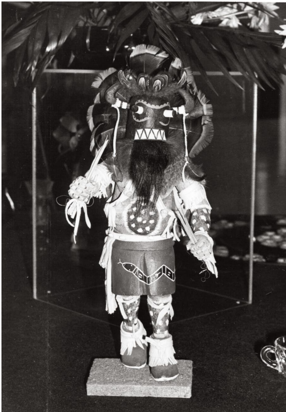
Figure 70. CHUSONA (HOPI SNAKE DANCERS) Sculpture, two figures