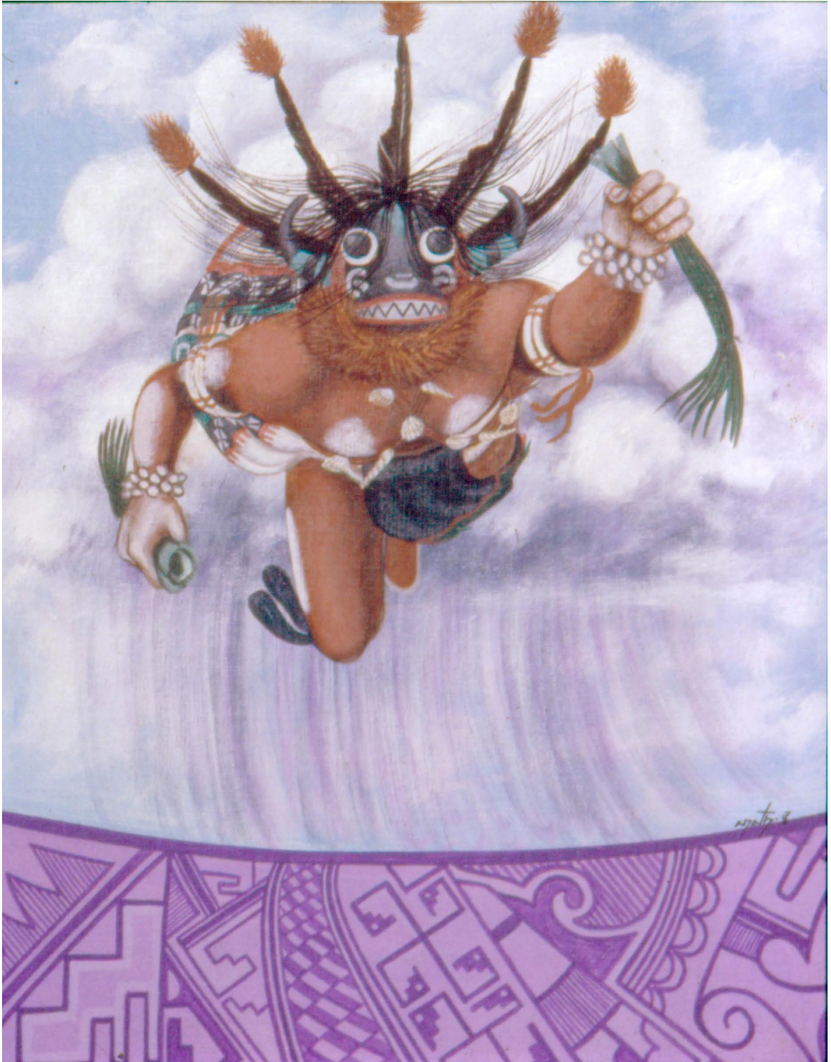
Figure 71. COMING OF CHAVEYO Nell David, Sr. painting, acrylic (Courtesy of Artist Hopid, Second Mesa, Arizona)