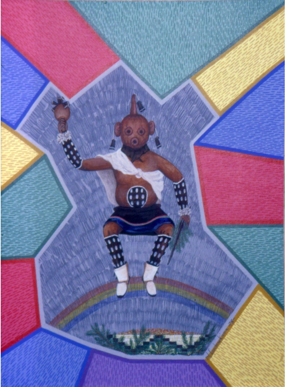
Figure 73. MUDHEAD DANCE Coochsiwukioma (Delbridge Honanie) painting, acrylic (Courtesy of Artist Hopid, Second Mesa, Arizona)