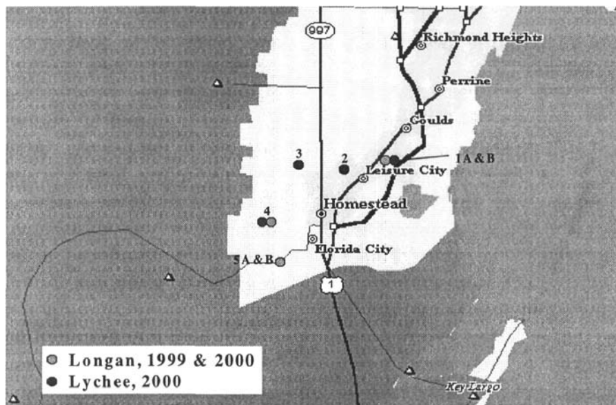
Figure 1. Location of orchards studied, Dade County, Florida.

We further expanded the study to include a lychee damage assessment. Due to the dominance of Mauritius variety trees in commercial production, our assessment was limited to orchards cultivating this variety. This assessment was set up as the longan assessments and we utilized four orchards. Two orchards were co-located with longan orchards used in the 1999 assessment. Since lychee panicles do not bear as many fruit as longans, we counted fruit on multiple panicles attached to a common branch. We selected 4 branches per tree. For each control panicle, fiberglass netting was used to exclude birds.