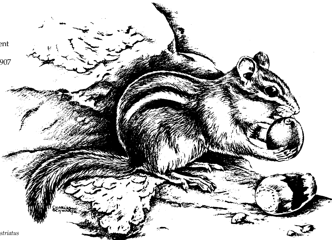
Fig. 1. Eastern chipmunk, Tamias striatus