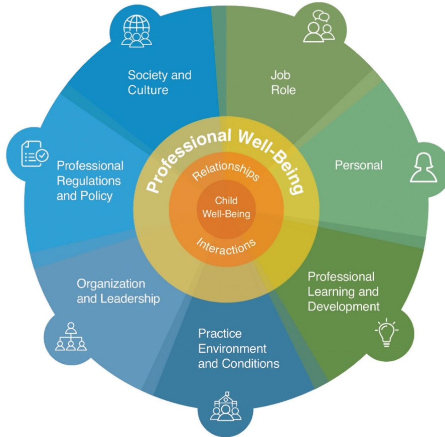
Figure 1. The Early Childhood Professional Well-being Ecological Framework (Gallagher and Roberts (2022)).

study is grounded in the Early Childhood Professional Well-being Ecological Framework by recognizing the importance and complexity of EC educators' well-being.