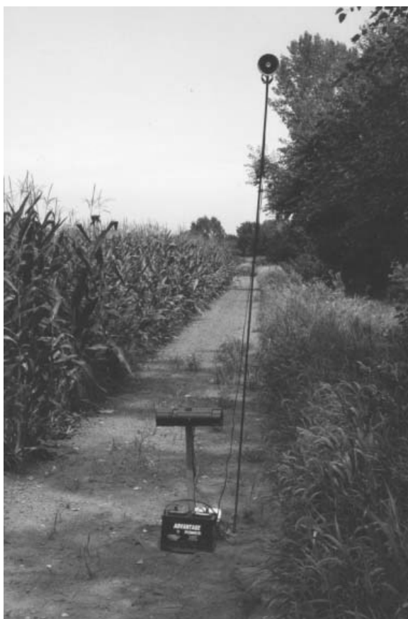
Figure 1. Infrared transmitting unit (left) and receiving unit (right) of the deer-activated bio-acoustic frightening device along the edge of a cornfield.

We used indices of track counts, corn yields, damage assessments, and use-areas of radiomarked deer to evaluate the efficacy of the frightening devices. A tractor-mounted 2-m-wide drag was used to establish and maintain a smooth dragline around the perimeter of each field. We counted tracks of deer entering and leaving cornfields in the 1 m of dragline nearest the corn about every 6 days. A single observer counted tracks on all fields to eliminate observer bias. We recorded 1 track count