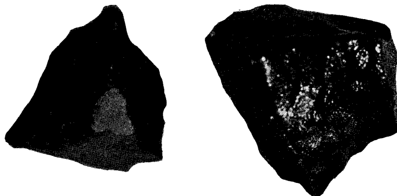
FIG. 182.—Two views of the Sioux County Meteorite No. 1-3-9-33, the Nebraska State Museum.

The Sioux County meteorite is 61 mm. (maximum length) by 48 mm. (maximum width) by 40 mm. (maximum thickness) and weighs 113.3 grams. Its light gray stony interior is covered with a thin, glossy, black and brown glazed crust formed by the melting of its surface during its passage through the air. This stone for a time was the only one recovered from this fall but later Mr. Nininger secured specimens. Several so-called meteorites were found near Alliance and Scottsbluff, but these proved to be haystack cinders.