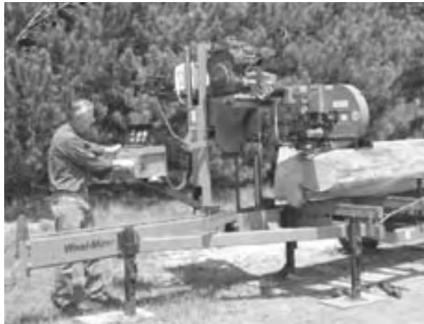
Evert Barton with his portable sawmill.

Known as Hidden Valley Sawmill, Evert does mostly custom work which includes the sawing of cedar trees for rough lumber, cottonwood for pallets, and power poles and railroad beams for decking and trailer floors. Other species for furniture and dimension lumber would include oak, ash, and occasionally cherry. One of the most unusual species that he has run through his mill is Teak that a customer purchased at auction. Over time Evert has made a display of "finished" wood samples to show people what the different species can look like in the furniture market.