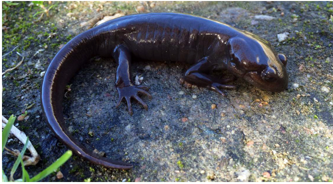
Fig. 2. Northwestern Salamander, Ambystoma gracile (UF-Herpetology 174919), from Walter Anderson Nursery, Poway, California.

However, no voucher has been deposited. Although A. gracile is native to California, these introductions occurred over 300 km from the southernmost part of its native range.