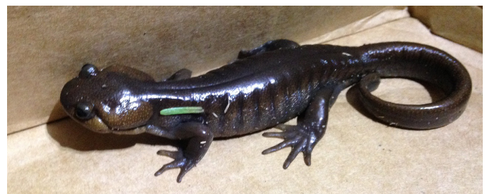
Fig. 1. Northwestern Salamander, Ambystoma gracile (UF-Herpetology 174498), from Fort Lauderdale, Broward County, Florida.