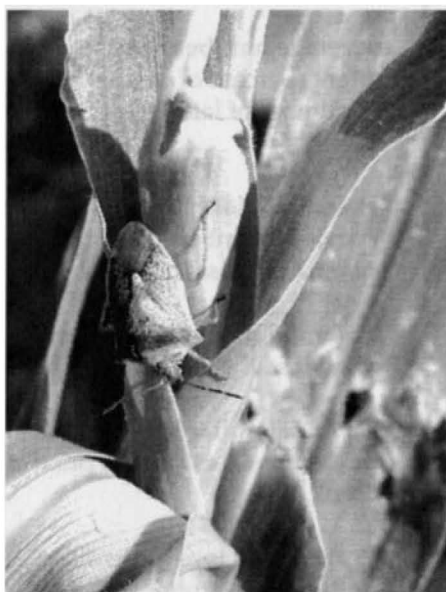
Stinkbug found damaging corn in eastern Nebraska.

While stinkbugs have not historically caused major crop damage in Nebraska, the following report from Phil Sloderbeck, a Kansas State University entomologist in southwest Kansas, is included to aid