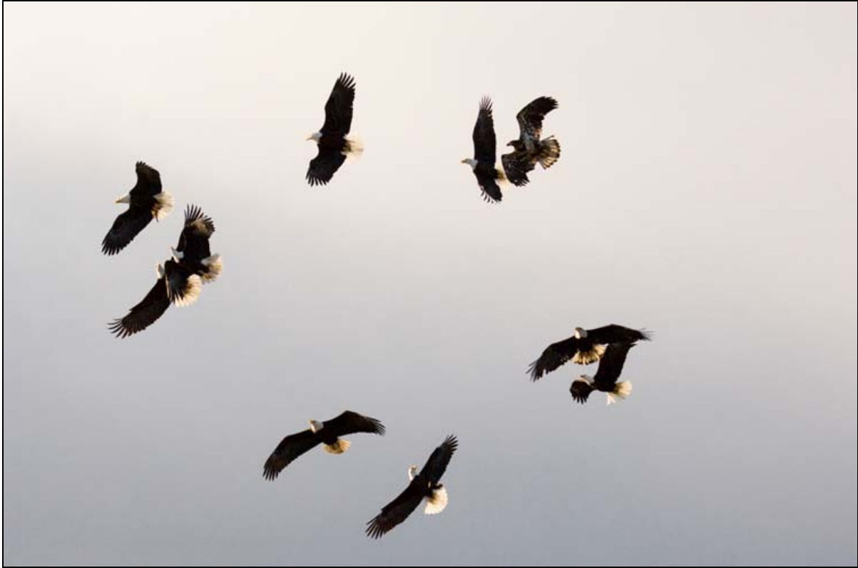
Figure 1. Bald eagles soaring in Homer, Alaska, 2007. The eagle population in Alaska is between 54,000 – 70,000 birds.