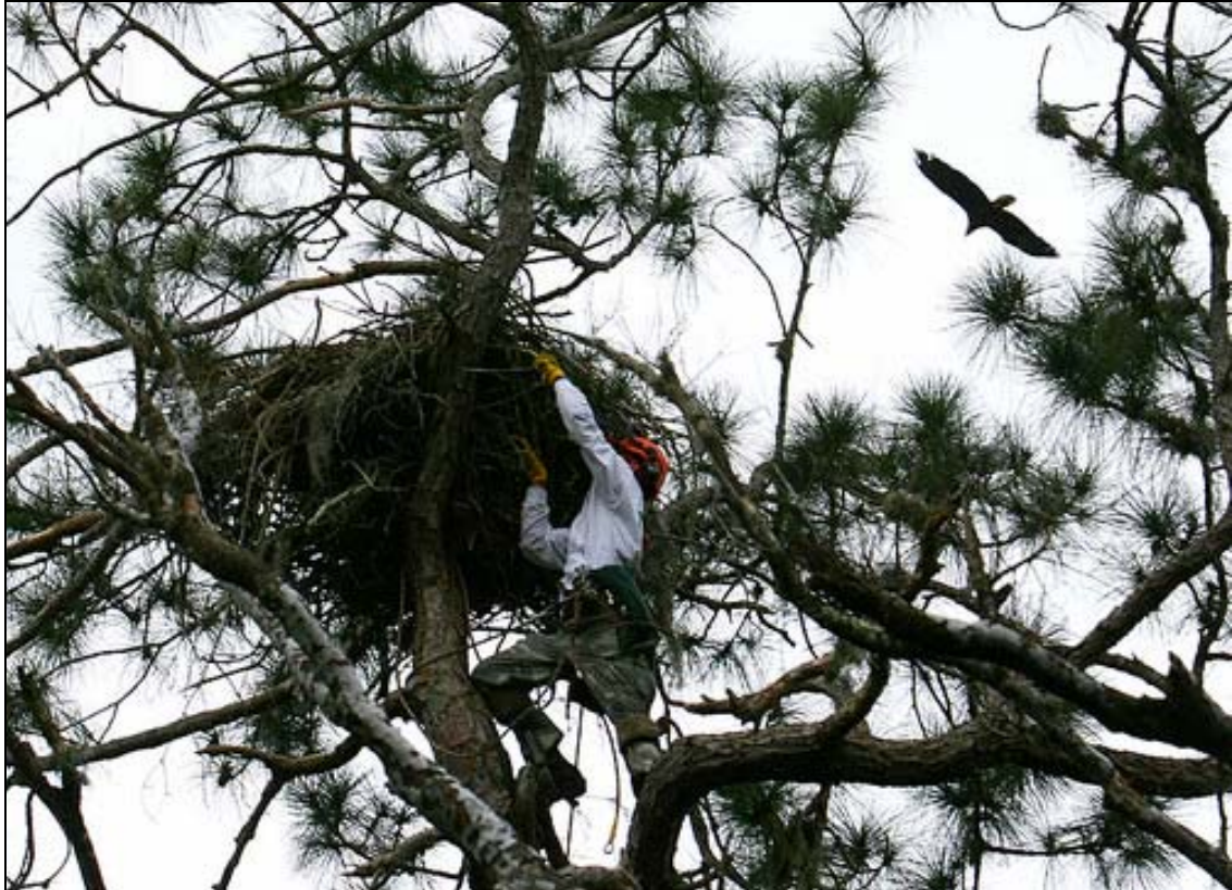
Figure 4. Bald eaglet is removed from nest near Orlando Sanford International Airport while parent flies overhead, 2007.