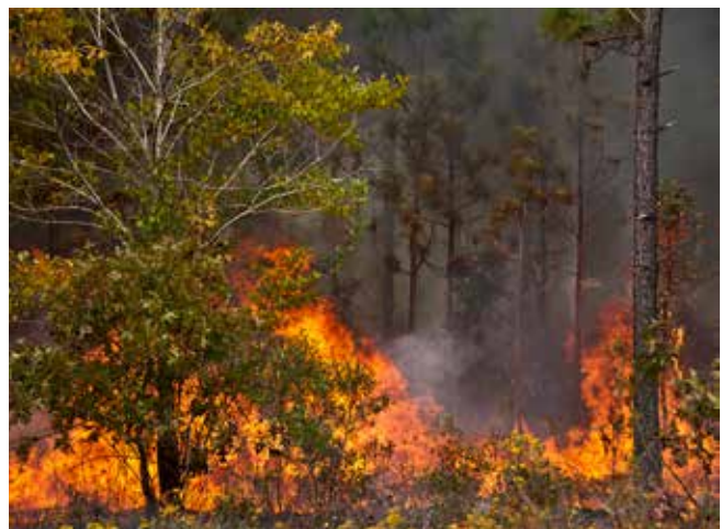
An RxCADRE prescribed fire consumes trees and shrubs at Eglin Air Force Base, Florida.