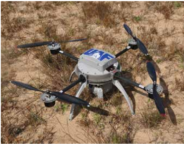
This unmanned aircraft system from the University of Alaska Fairbanks prepares to launch and collect infrared and visible imagery over an RxCADRE research burn block for assessment of fire behavior.