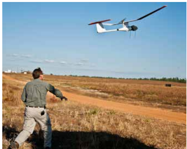
An unmanned aircraft system is launched.