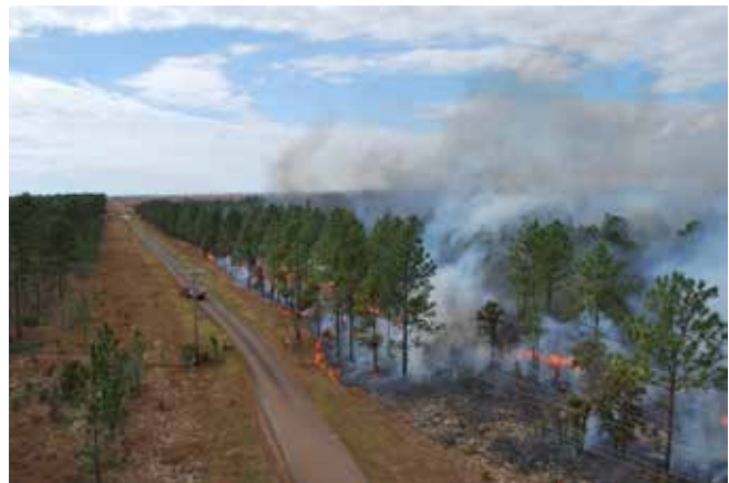
Personnel from Eglin Air Force Base's Jackson Guard ride all-terrain vehicles to ignite a 200-hectare forested burn block.

The initial study plan called for two large operational-scale burns (up to 500 hectares) on land covered with grass and grass/turkey oak vegetation. Nested within these large plots were several smaller highly instrumented plots (HIPs) of 20 by 20 meters. The large burns, including the HIPs, were loaded with instruments to measure larger scale fire behavior and fire-atmospheric interactions, including smoke dynamics. Alongside the operational burn plots were