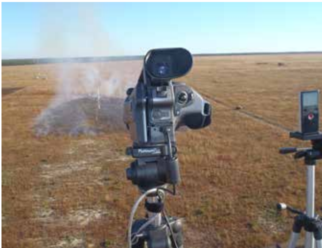
Infrared and still camera captures fire spread from a 26-meter-tall boom lift positioned upwind of a research burn block.