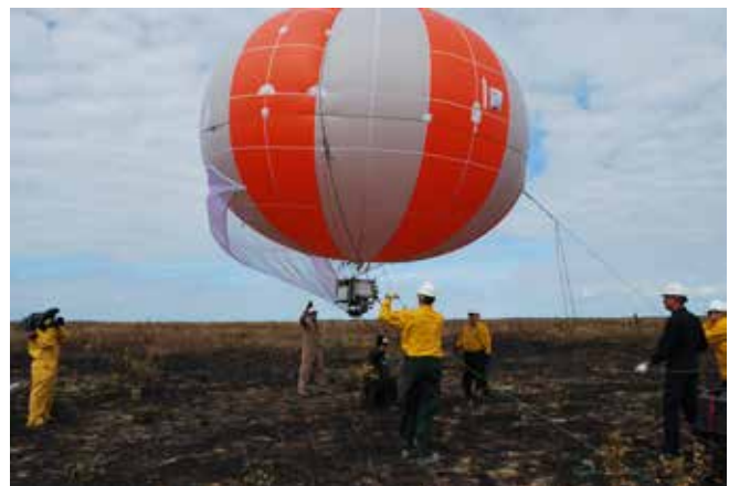
Brian Gullett and the team from the Environmental Protection Agency prepare to launch a balloon into the smoke plume to measure emissions from the forested research burn block.