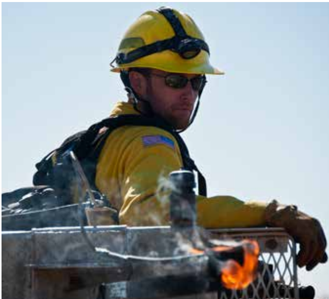
A member of Eglin Air Force Base's Jackson Guard awaits the order to ignite the RxCADRE prescribed fire.

Beneath the ScanEagle, the other two unmanned aircraft make ribbon-candy passes over two smaller subplots with coffee cans of glowing charcoal marking their corners. These aircraft capture a stream of visible and infrared images of the flame front. Thanks to careful programming and remote control, they deftly avoid hitting the towers and balloons.