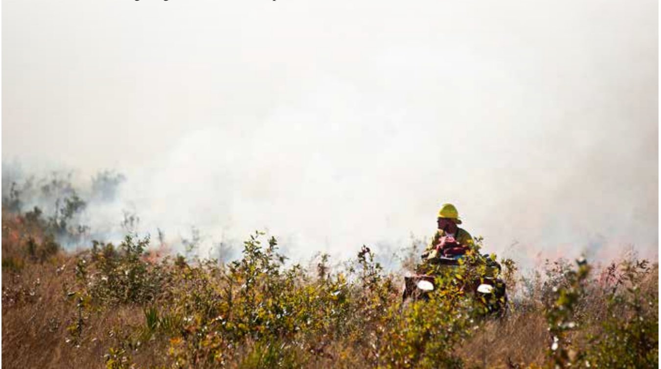
A Jackson Guard member moves ahead of the smoke from an RxCADRE fire.