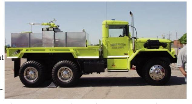
This 5 ton 6x6 tanker with cannon is another vehicle that came through the Fire Shop through the FEPP. The cooperating fire department (Cedar Bluffs) did the finish work.