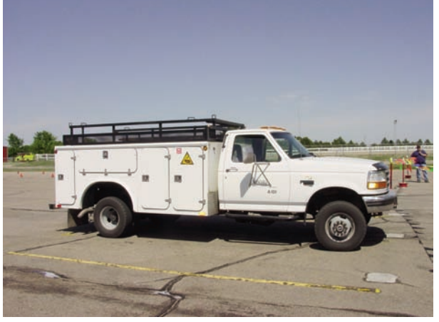
Shop. This inspection will take place The newest NFS mobile repair unit can provide during NFS inventory visits. Based on on-site service to cooperating fire departments.

Sieber also says that beginning in 2006, each vehicle will receive a complimentary inspection by the Fire Shop. This inspection will take place during NFS inventory visits. Based on this inspection, the fire department will