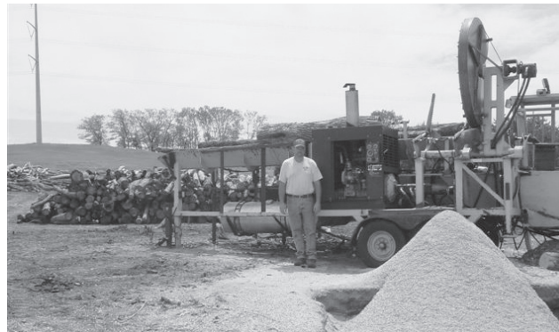
Brian with firewood processor.