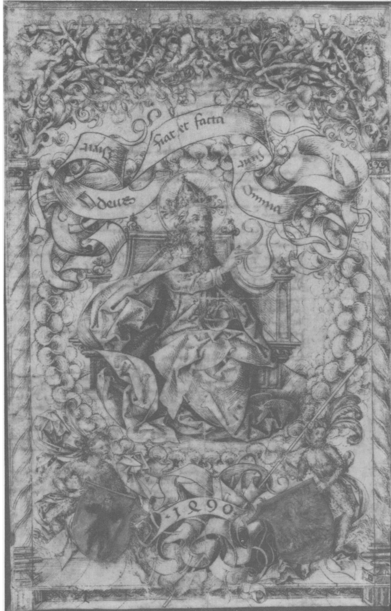
Fig. 5 possible that they considered woodcutting demeaning. 10 Yet sculptors in the fifteenth century were often included in the painters' guild; therefore, the cutting of wood for woodcuts and for sculpture at that time must be differentiated. 11

The designer did not usually cut his own blocks. Wolgemut, for example, headed a large workshop and was the leading painter in Nuremberg in the late fifteenth century. He was also a woodcut designer, but probably not a woodcutter. Dürer was apprenticed to Wolgemut from 1486 to 1490, when he most likely learned woodcut design but not cutting. Wolgemut worked as the artistic head of the Nuremberg Chronicle , which was printed by Anton Koberger in 1493. Assisting in the project were Dürer, who was Koberger's godson, and Wilhelm Pleydenwurff, who was Wolgemut's stepson. Koberger had begun his printing career in 1470, and by 1491, the date of the Chronicle's contract,