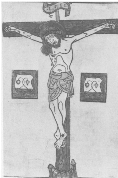
Fig. 3 Albrecht Dürer, The Four Horsemen, 1497-98, woodcut. New York, The Metropolitan Museum of Art, Gift of Junius S. Morgan, 1919.