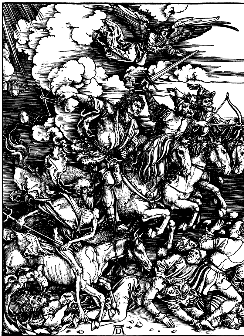
Fig. 3 one location?

The method employed for transferring the design is also problematic. The design could have been flopped onto the block and then greased for transparency, or the drawing could have been transferred to the block by pouncing. It seems probable that Dürer's Apocalypse woodcuts of 1497-98 ( Fig. 3 ) were cut from detailed drawings that were glued to the blocks. Later, for his Coat of Arms of Michael Behaim , of about 1510-11 ( Fig. 4 ), Dürer probably drew directly onto the block, as he implies he did in a letter to Behaim that is located on the back of the block. 5 Drawing directly onto the woodblock was not common until the sixteenth century when woodcuts were apparently turned out with increased speed. Prior to direct drawing, whether the designer or the cutter was responsible for transferring the design onto the block is not known.