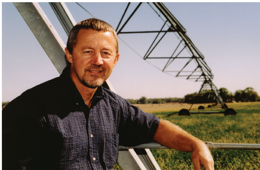
UNL College of Engineering