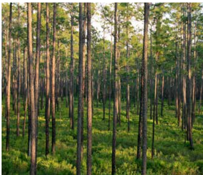
Green flatwoods forest in Florida.