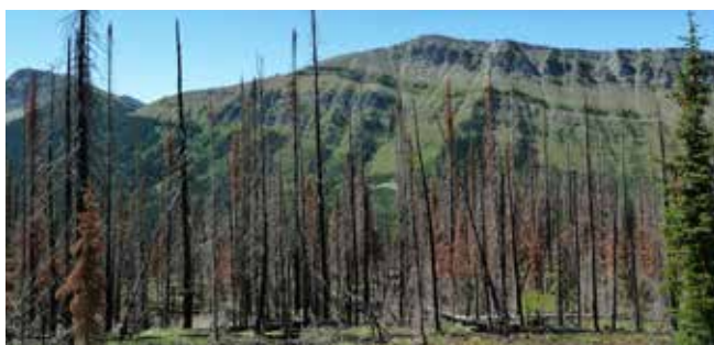
Forest in the northern Rockies where Brian Harvey studied burn-severity patterns.

useful information for probing deeper. A weak signal of changing patterns might be partly due to the very heterogeneity being examined—burn severity is highly variable to start with, and pattern changes might be expected to be subtle and hard to detect.