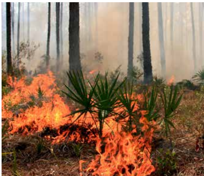
Flatwoods forest in Florida where fuels have been masticated.

“The GRIN funding enabled me to contribute the soils carbon component, which they wouldn’t otherwise have been able to do,” Godwin says. “I was able to add about a year of monthly measurements at that site, which came out to almost 3,000 individual measurements of soil temperature, moisture, and