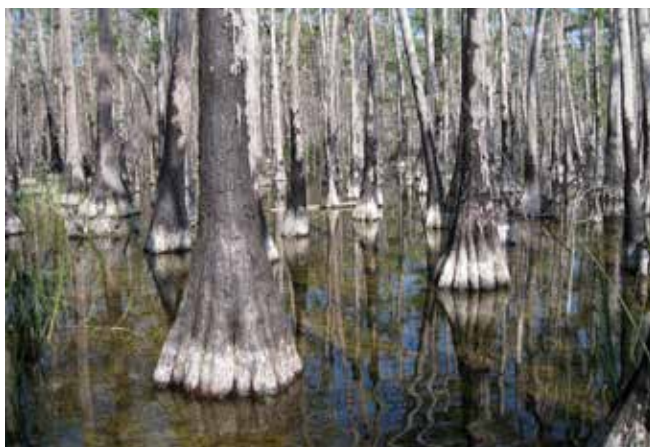
Florida cypress domes during the wet season, which Adam Watts studied to determine the influence of fire and flooding on the ecological edge effects of cypress domes.