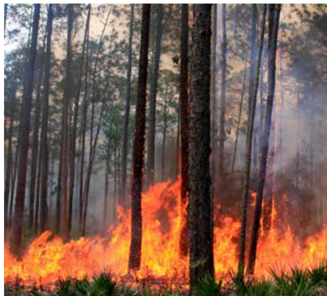
Burning flatwoods forest in Florida.