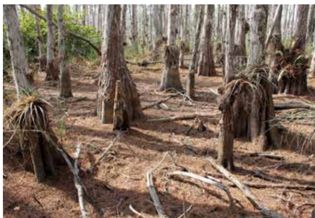
Florida cypress domes during the dry season.

in cypress swamps. Watts was also curious whether the seasonal flooding and the frequent fires would overrule edge effects in shaping the microclimate within the cypress domes. He found that cypress domes do show edge effects similar to those in other forest systems. The influence of seasonal flooding, however, was less conclusive. When standing water was present, says Watts, the gradient of shifting microclimate conditions between edge and interior became less pronounced, but a gradient was still detectable—suggesting that flooding does not pose a “hydrologic switch” that overwhelms the edge effects.