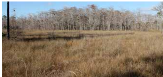
Florida cypress wetlands.

in Reno, Nevada, in the summer of 2013. “GRIN positioned me well to be in the right place at the right time,” he says.