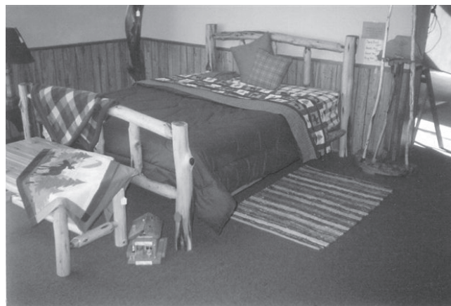
Barager rustic furniture.

Ten Acre Woods can be contacted at: HC 62, Box 48, Long Pine, NE 69217; phone: 402-387-1268. The full line of Ten Acre Woods’ products can be viewed on the Niobrara Valley Wood Products website: www.niobrara-valleyproducts.com .