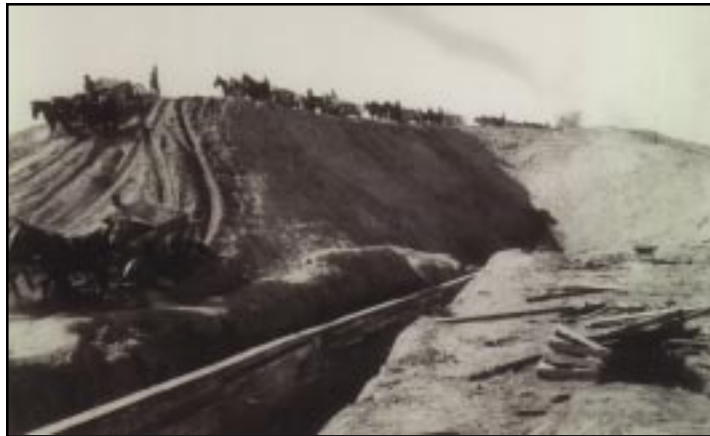
Muscle and determination helped build U.S. Bureau of Reclamation irrigation projects. Here, men and horses haul backfill material for sluicing into a cut-off trench at Minatare Dam in October, 1913. Additional copies of the October, 2002 Water Current giving the history of Bureau projects in Nebraska and eastern Wyoming are available free from the UNL Water Center.