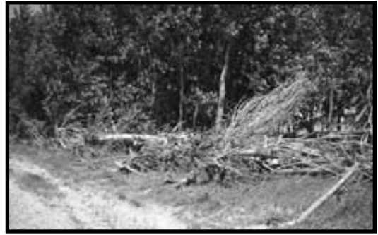
Properly planned, waterbreaks can effectively trap flood debris.