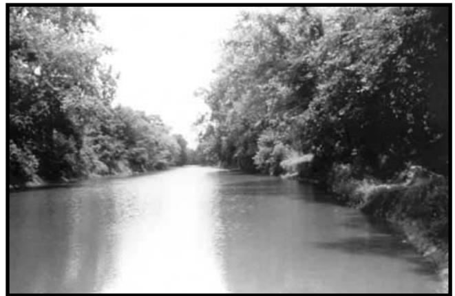
Trees along this streambank will effectively control bank and surface erosion.

In addition, complex ownership patterns may require group planning for proper waterbreak design, function, use, and management.