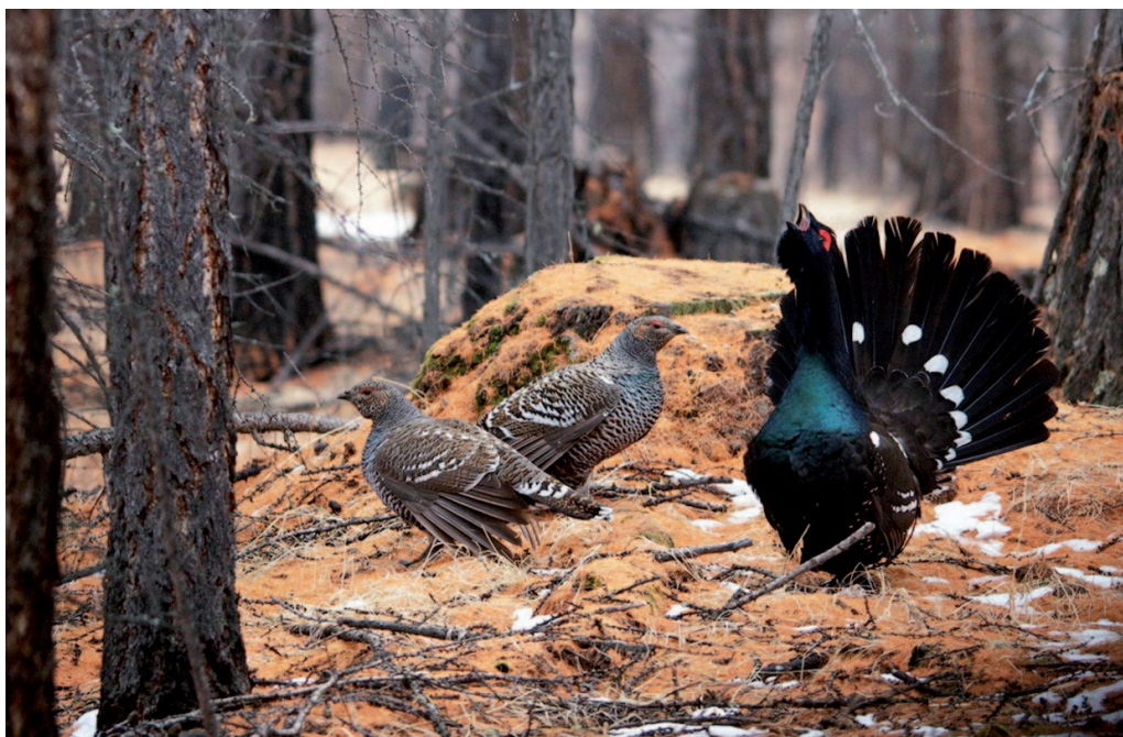
Fig. 9: Intensive courtship: A female ready to copulate with wings touching the ground (7.5.2011, Gorchij-Terelsh National Park, Khentej).

The preservation of old-growth forests of larch and mixed forests with larch and cedar form necessary conditions for the survival of a viable population of this “umbrella species” of the avifauna of the northern Mongolian taiga. Future studies should help to answer the question if the naturally