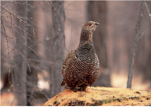
Fig. 3: The female plumage of the Mongolian subspecies is browner than that of the nominate form. They also lack the reddish-brown patch on the breast typical for female common capercaillie (7.5.2011 Gorchij-Terelsh National Park, Khentej).