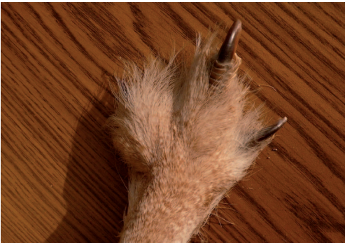
Fig. 5: Very long tarsal feathers covering the toes of a female of the nominate subspecies (Magadan region).