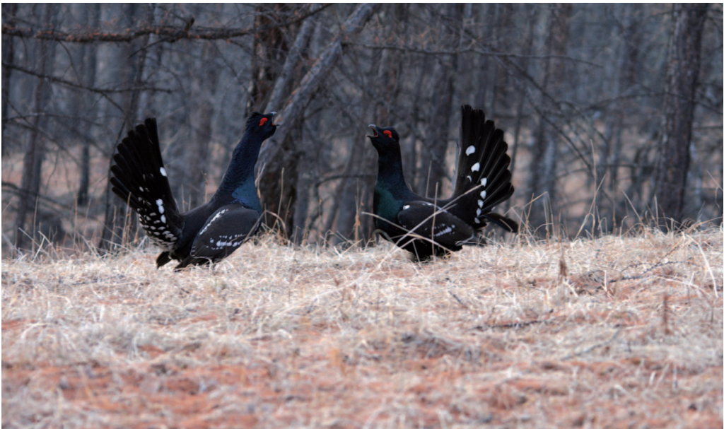
Fig. 8: Two males in aggressive posture just before fighting. On the left, a 2 year old cock which is seen from many white undertail spots and the posture with elongated neck indicating some fear, the cock on the right is over 4 years old with thicker neck in aggressive posture (13.5.2011, Gorchij-Terelsh National Park, Khentej,).

The first female was observed at the lek on 3 May. On 7 May the courtship behaviour culminated when 3 females with small red combs were on the ground close to the courting male (distances