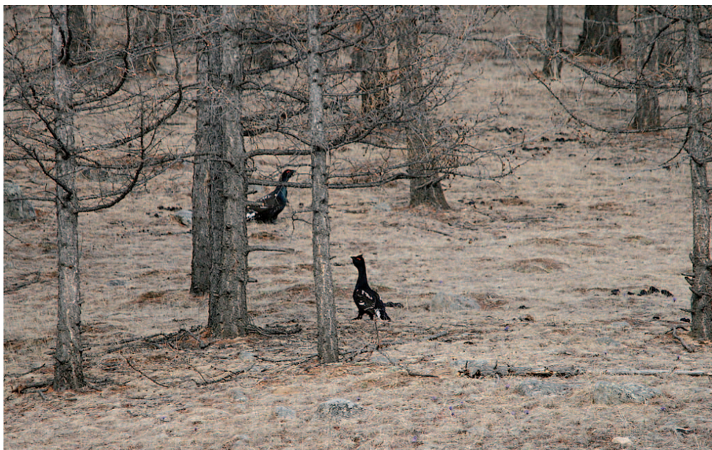
Fig. 2: Two male black-billed capercaillie on their feeding ground 200 m from the lek near the border of larch taiga (3.5.2011, Gorchij-Terelsh National Park, Khentej).

Lek No. 2 with four displaying males was a secondary habitat, a succession forest of a 40–50 year old birch stand, resembling the situation in Kamchatka (KLAUS et al. 1989).