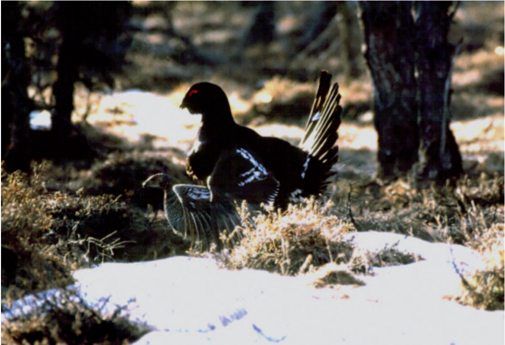
Fig. 10: Mounting male, just before copulation (13.5.1994, Omchik valley, Magadan,).

fragmented pattern of forest distribution in parts of the Mongolian mountains causes a lower density and smaller leks of the black-billed capercaillie as compared with the closed taiga of northern and north-eastern Siberia. The system of national parks and other nature reserves in Mongolia (WWF 2000) form a substantial precondition for the protection of this impressive and large woodland grouse and other forest birds of the Mongolian avifauna.