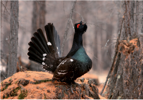
Fig. 4: Male of the Mongolian subspecies. Tarsal feathers are shorter and toes visible (7.5.2011, Gorchij-Terelsh National Park, Khentej, photo by K.H. Schindlatz).