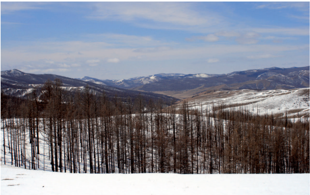
Fig. 1: The forest landscape dominated by Siberian larch near to the lek is fragmented and bordered by open grassland (30.4.2011, Gorchij-Terelsh National Park, Khentej,).

The first female visited the lek on 3 May and two more females were seen feeding nearby, indicating that the “high season” was approaching. On May 5 and 6 fresh snow covered the ground and trees. One female was noted feeding on larch trees. Two males were actively displaying on the ground. On 6 May the males were highly active, displaying in deep snow, and on 7 May, the first