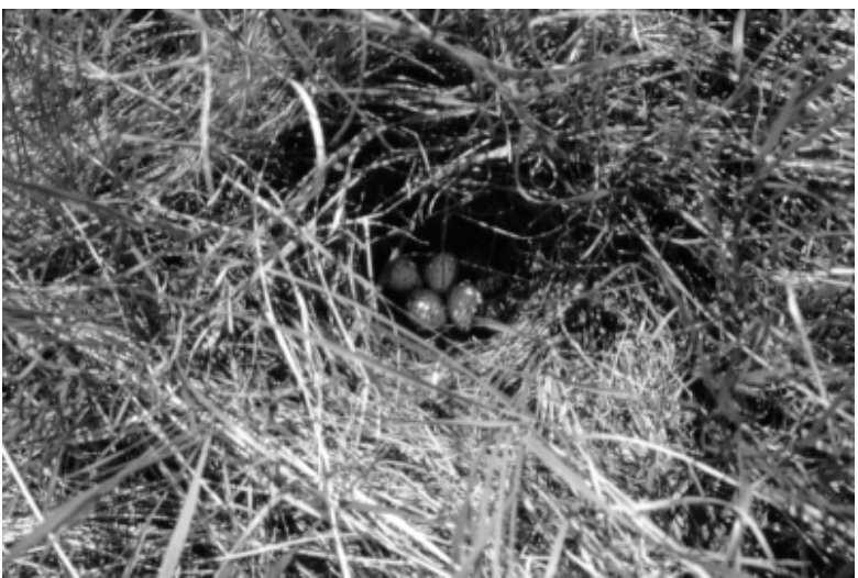
Pheasant nest (Courtesy SD Game, Fish and Parks Department).