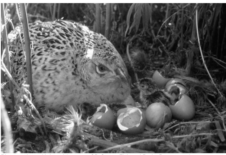
Pheasant hen with brood. Winter Protective Cover