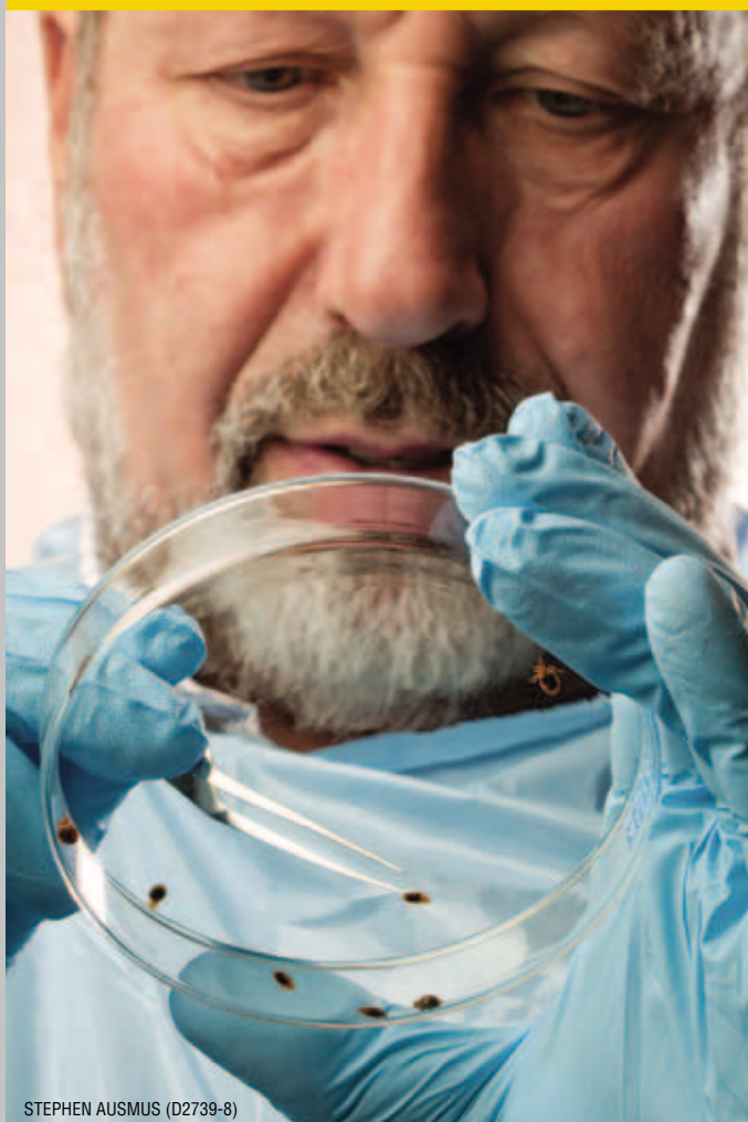
STEPHEN AUSMUS (D2739-8)

Above: Immature bed bugs molt and shed their skins only after blood feeding. ARS entomologist Mark Feldlaufer collects blood-fed, immature bed bugs that he will isolate in vials to collect individual shed skins for chemical analysis.