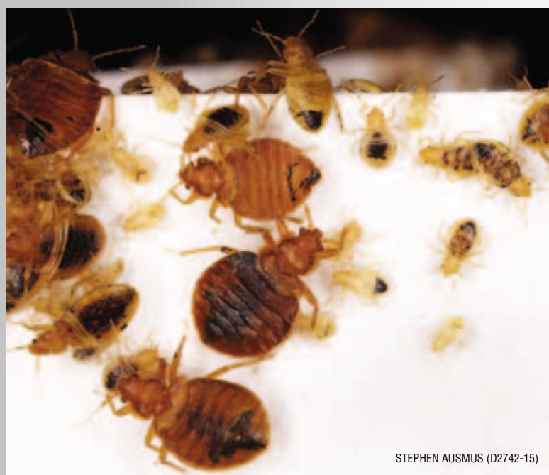
STEPHEN AUSMUS (D2742-15)

Above: Immature bed bugs molt and shed their skins only after blood feeding. ARS entomologist Mark Feldlaufer collects blood-fed, immature bed bugs that he will isolate in vials to collect individual shed skins for chemical analysis.