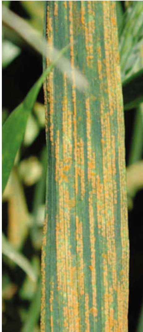
Stripe rust can cause significant yield losses to wheat growers.

In Washington, Cara was planted on 17,900 acres in 2011, primarily in the