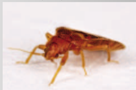
STEPHEN AUSMUS (D2741-23)

Above: An adult bed bug, Cimex lectularius , is roughly 4 mm in length. Immature and adult bugs are very flat, making it easy for them to hide in cracks and crevices.