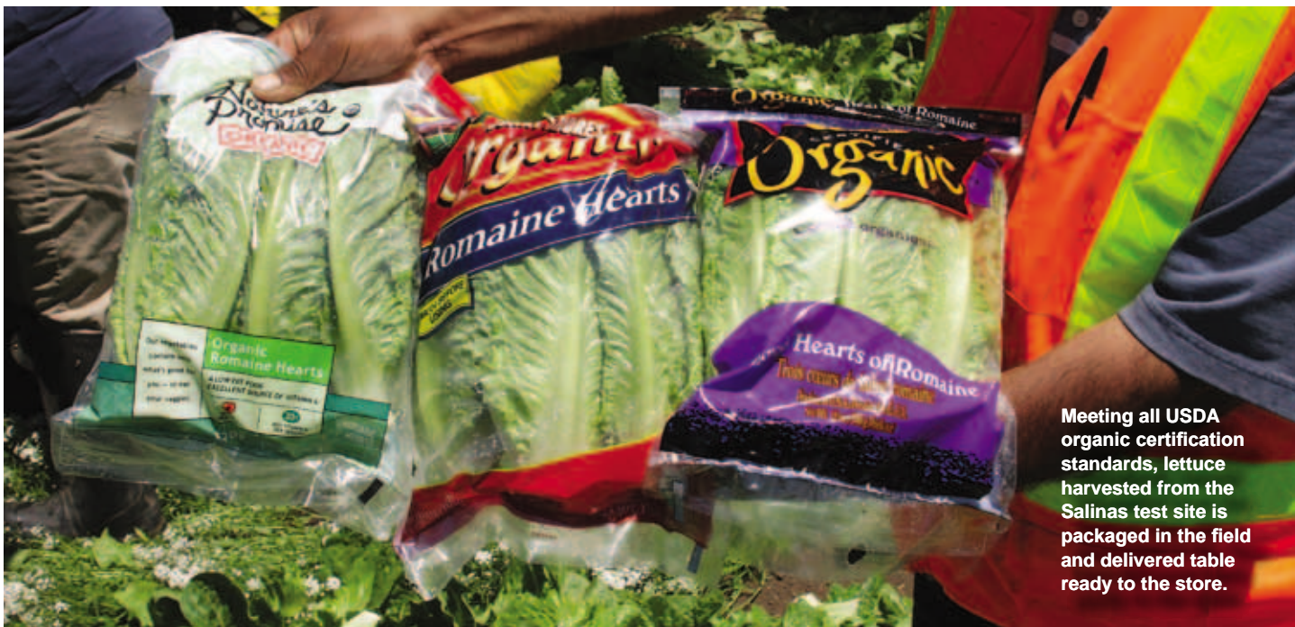
Meeting all USDA organic certification standards, lettuce harvested from the Salinas test site is packaged in the field and delivered table ready to the store.