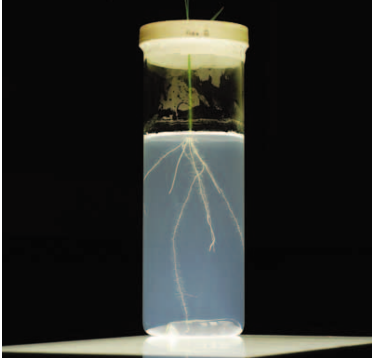
Azucena rice, an upland cultivated variety, growing in a growth cylinder system used to capture the dynamic growth of root systems in three dimensions.