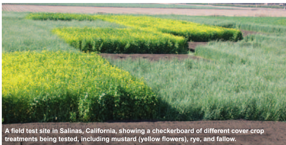
A field test site in Salinas, California, showing a checkerboard of different cover crop treatments being tested, including mustard (yellow flowers), rye, and fallow.

Eric Brennan is in the USDA-ARS Crop Improvement and Protection Research Unit, 1636 E. Alisal St., Salinas, CA 93905; (831) 755-2822, eric.brennan@ars.usda.gov .✱