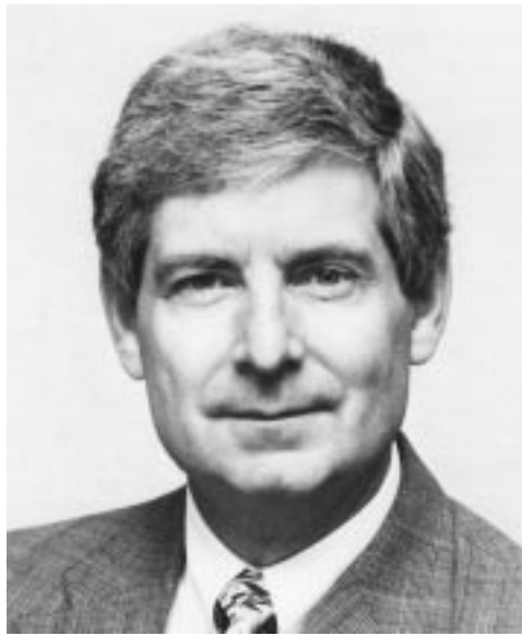
Bill Hartwig.

We are a separate organization with a separate and important mission and we are funded by federal tax dollars. In this day of dwindling budgets and smaller staff, we need