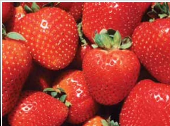
BRIAN PRECHTEL (K9189-1)