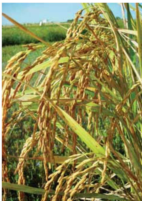
KEITH WELLER (K8136-1)

WRRC scientists have shown that the main flavor compound in aromatic rice, prized for its aroma and taste, is also in some other foods.