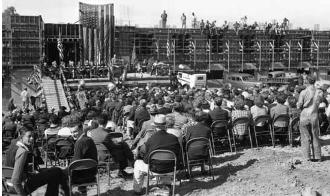
The cornerstone-laying ceremony, October 27, 1939, for the Western Regional Research Center (WRRC), in Albany, California. WRRC is the only research center in the 21-year history of the American Chemical Society's National Historic Chemical Landmarks Program to receive two awards for its research.

The WRRC research being cited by the ACS revolutionized the field of flavor chemistry by identifying major flavor compounds and developing both techniques to evaluate flavor constituents and analytical tools and methods to study flavor. The award reflects a huge body of research by a team focused on determining the chemical "essence" of flavors and odors.