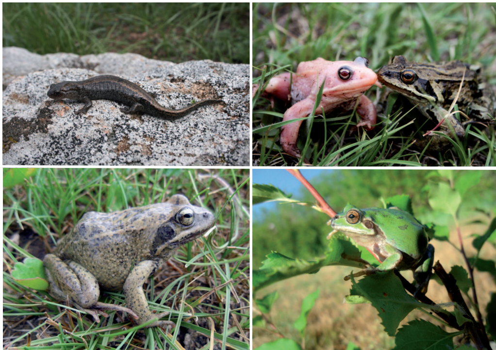
Fig. 3: Siberian salamander ( Salamandrella keyserlingii ) in the Darchad basin (above left), albino and normal Siberian frog* ( Rana amurensis ) (above right), Asiatic grass frog ( Rana chensinensis ) at Khargiltain-gol, Suchbaatar province (below left), and Japanese tree frog ( Hyla japonica ) (below right), which is registered in the Mongolian “Red Book” (1987).

We have found some species rare for last 30-50 years in the Mongolian desert and some new species records for Mongolia such as the Caspian even-fingered gecko ( Alsophylax pipiens ), Przewalski's wonder gecko ( Teratoscincus przewalskii ), Gobi naked-toed gecko ( Cyrtopodion elongates ), and Variegated racerunner ( Eremias vermiculata ). These findings are related to the improvement and intensity of research, and also regarding with global warming and expansion of thermophile organisms' distribution and area to the North.