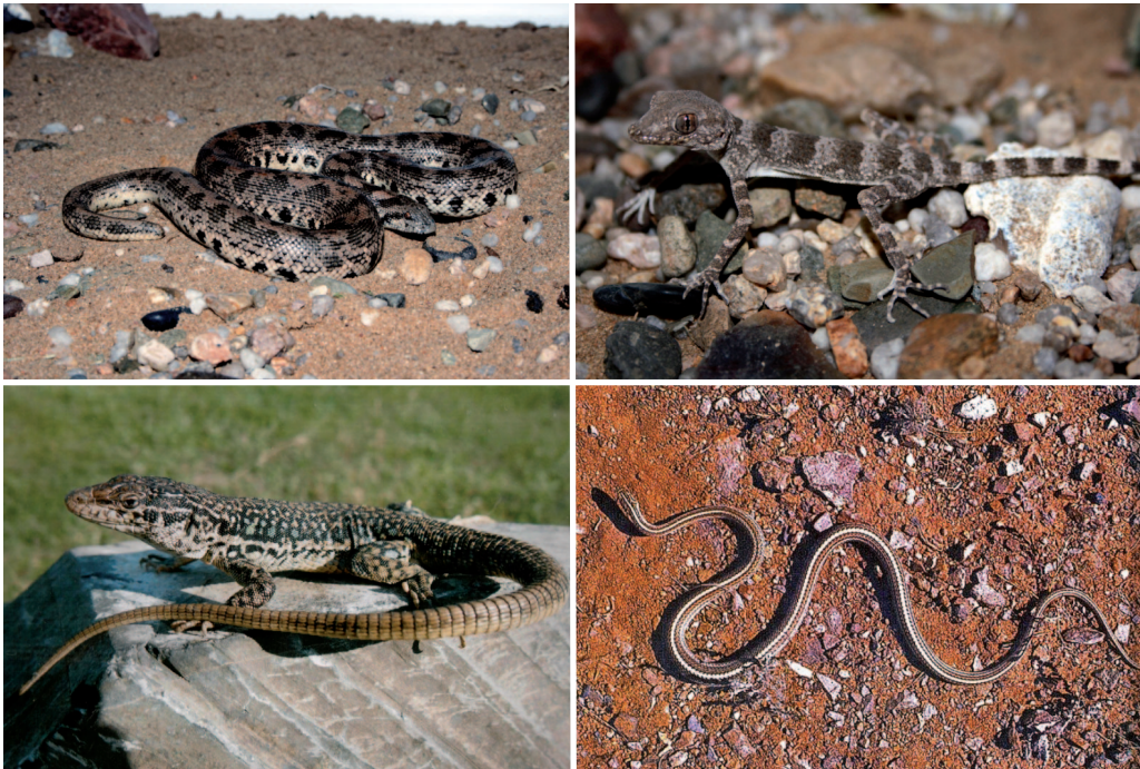
Fig. 4: Govi naked-toad gecko ( Cyrtopodion elongates ) (above right), Tatar sand boa ( Eryx tataricus ) in the valley Nogoon-tsav (above right), Slender racer ( Coluber spinalis ) in Uuliin Hudag, Middle Govi province, Multiocellated racerunner ( Eremias multiocellata tsaganbogdensis ); photos: Kh. MUNKHBAYAR.

Four species of amphibians and five species of reptiles are included into the Mongolian Red Book (1988, 1997). Also, the Mongolian Red List for amphibians and reptiles and the Summary Conservation Action Plans for Mongolian reptiles and amphibians (2006) are published by the Zoological Society of London. 66 % of Mongolian amphibians are evaluated as vulnerable by regional evaluation according to IUCN categories.