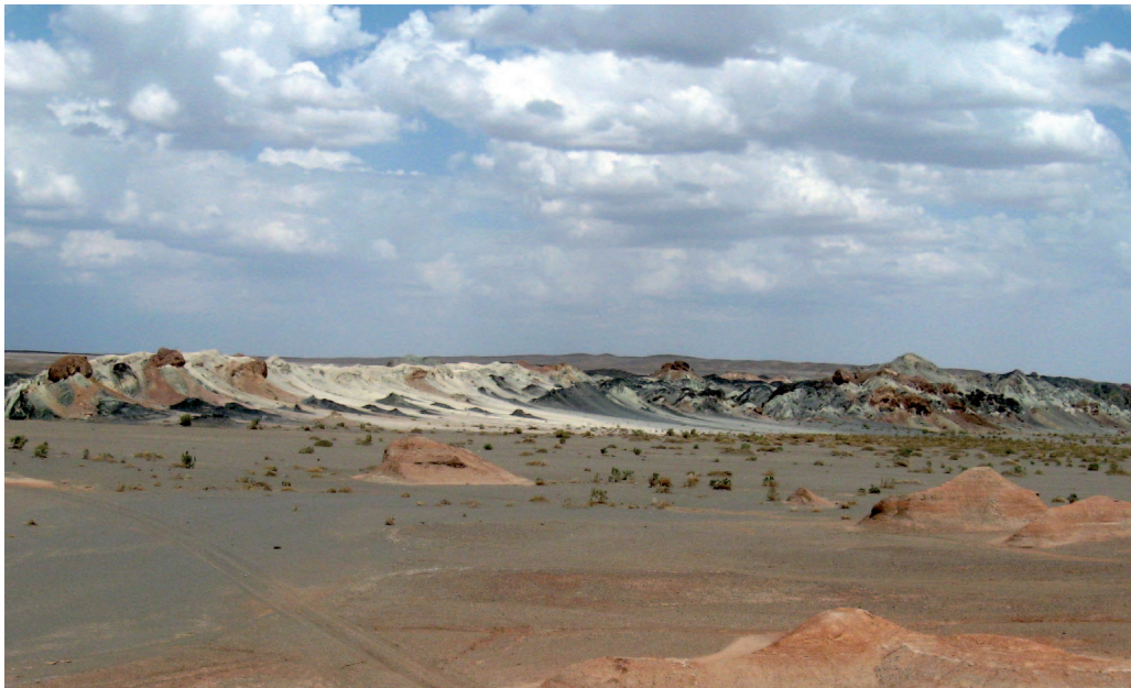
Fig. 6: General view of the valley of Nagoon-tsav, Trans-Altai Gobi