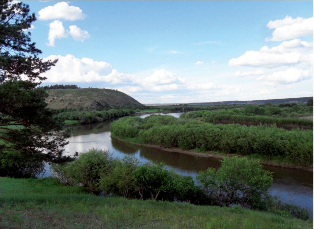
Fig. 5: Buureg Tolgoi, downstream of the river Orkhon, near Shaamar soum.