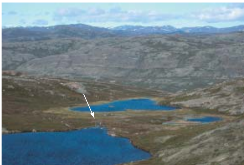
Fig. 4. The outflow from lake G, showing the two ponds and associated wetland areas. The hydrological station, which is just visible ( arrowed ), provides scale. The lake in the centre of the view is approximately 100 m across.