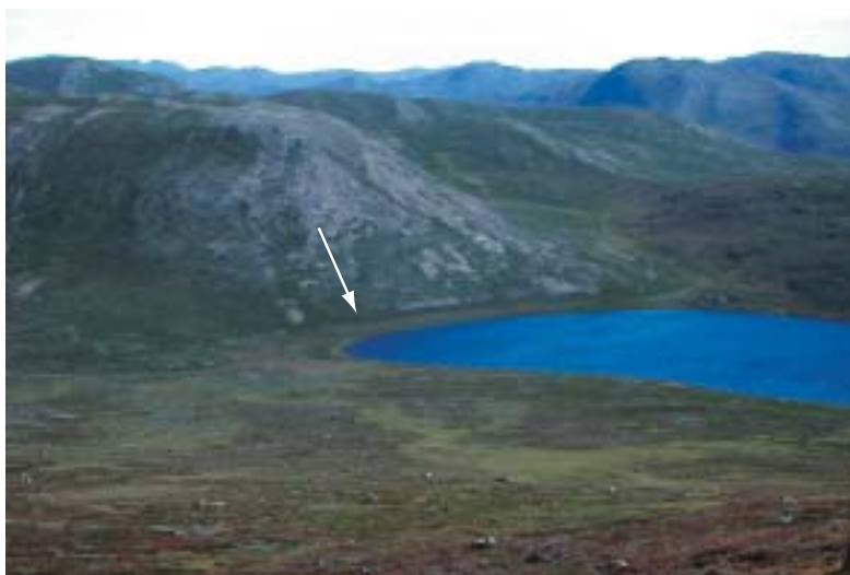
Fig. 3. Looking down on Lake E. The fossil shoreline development on the far (north-eastern) shore is clear. The upper limit of the shoreline is approximately 7 m above present lake level ( arrowed ). Width of the lake is c. 500 m.

Field work was conducted during three periods: late April to early May, June and August. The initial field work undertaken in late April – early May used the ice cover