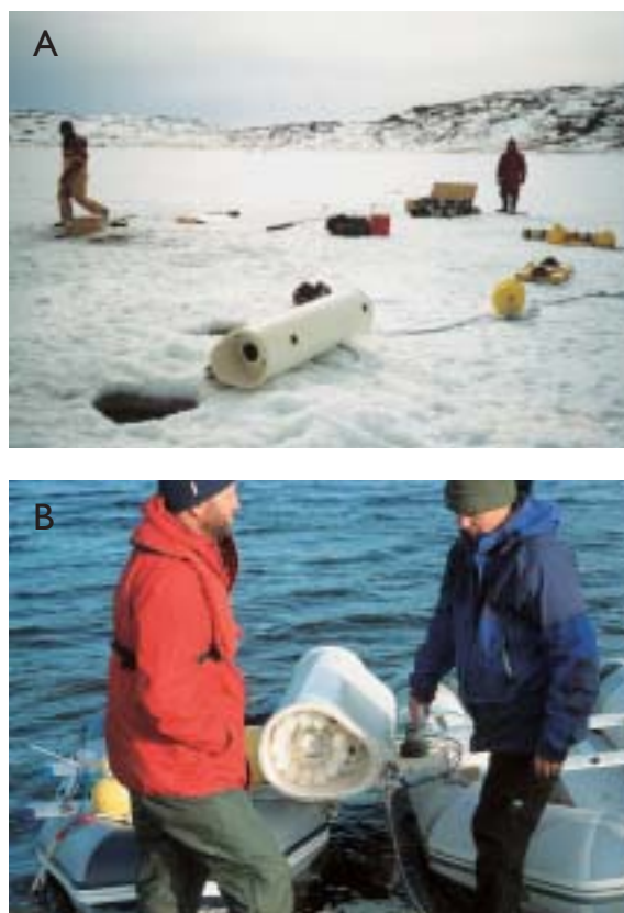
Fig. 5. A: A Technicap sediment trap on the ice at Lake E prior to deployment; 26 April 2001. B: A sediment trap lying on the improvised raft prior to redeployment in August 2001; the collecting bottles are clearly visible.

In an effort to determine sediment transport within the catchment, a number of simple sediment traps were set out to determine surface transport and atmospheric inputs to the lakes. The hydrological stations were checked in June, and those sensors that could not be