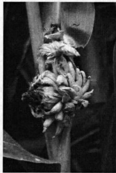
Corn smut -- appetizer anyone?

Many questions concerning toxicity and allergenicity have been raised about corn contaminated with the spores of this fungus. There are