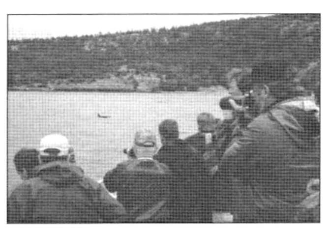
The workshop field trip was a whale watching cruise in the San Juan Islands—the tour, led by Captain Trivia, encountered several pods of Orca.