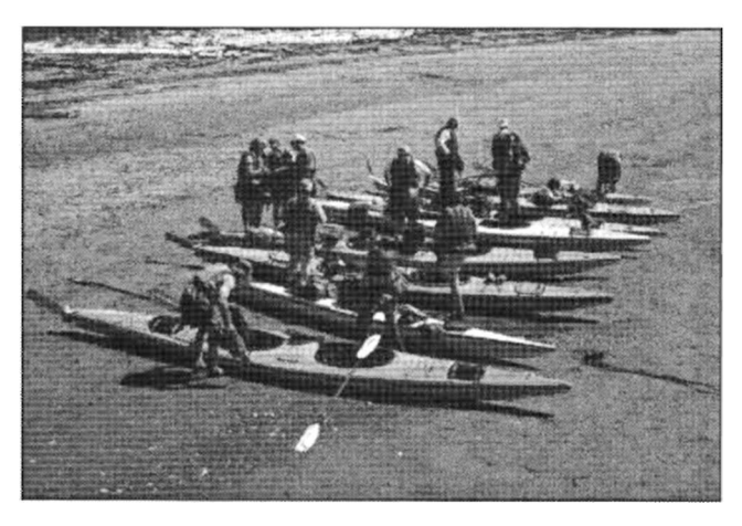
Several people participated in the pre-workshop field trip to Olympic National Park and the San Juan kayak overnight (above).