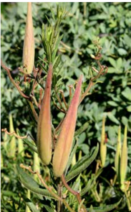
Seedheads of butterfly milkweed, one of Gladys Jeurink's perennial favorites.

Right now (mid-April), my favorite is bluebells, the Mertensias that are in bloom. They do well in dark shade. They're fun in that they die down in early May. Mine are growing under a cottonwood tree. I love to sit under a cottonwood tree so I have my furniture under one, but in early March I move the furniture out and let the bluebells take over. They make a solid blue mass. I'll move my furniture back in when they die down.