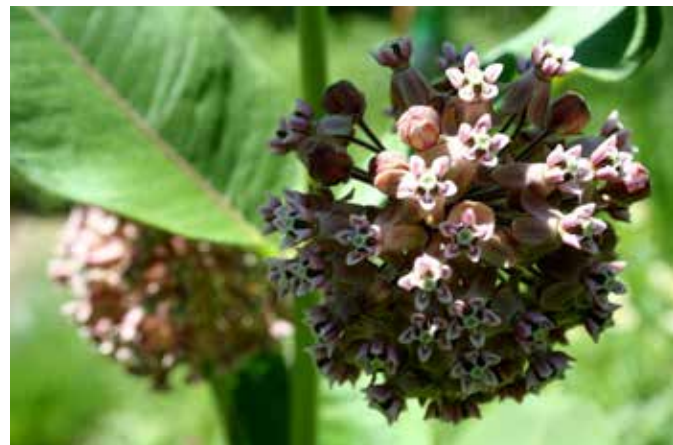
Pioneers Park Nature Center prairie (top); leadplant in bloom with close-up of foliage inset; milkweed in flower (bottom).

Plains Indians used white sage for both medicinal and religious purposes burning it in bunches as incense. It was sometimes used as a towel. Among settlers, it was occasionally used to prepare a hair rinse to prevent baldness.