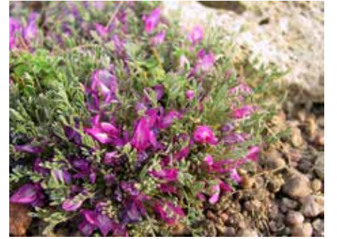
Penstemon and Barr's milkvetch (bottom).

"I'm a little prejudiced toward the penstemons not only because of their beauty but also because I have the pleasure to work with them. There is such a great variety of types and sizes and colors and they're constantly changing throughout the season. Husker Red is one of my favorites as well as Penstemon grandiflorus . Like many people, I associate my favorite wildflowers with people I have met. In my work with wildflowers I've met a lot of really great people, people who have a passion for wildflowers. Since I'm a native of Nebraska, I feel a special connection to our native plants."