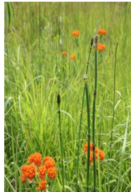
Restored prairie at Lincoln Creek Prairie near Aurora (top photo courtesy of Bill Whitney, Prairie Plains Resource Institute). Butterfly milkweed brightens the landscape.

Fire is another method of removing old prairie thatch. In natural prairie ecosystems, fire not only gets rid of accumulated thatch, it also helps reduce woody plant invasion and stimulates the growth of many native grasses and wildflowers. Rotation between prescribed burns and cutting is ideal for prairies and savannas. Keep in mind that a controlled burn is a useful maintenance tool, but requires some expertise. Be certain to check local regulations and permit procedures and, when burning, always use caution.