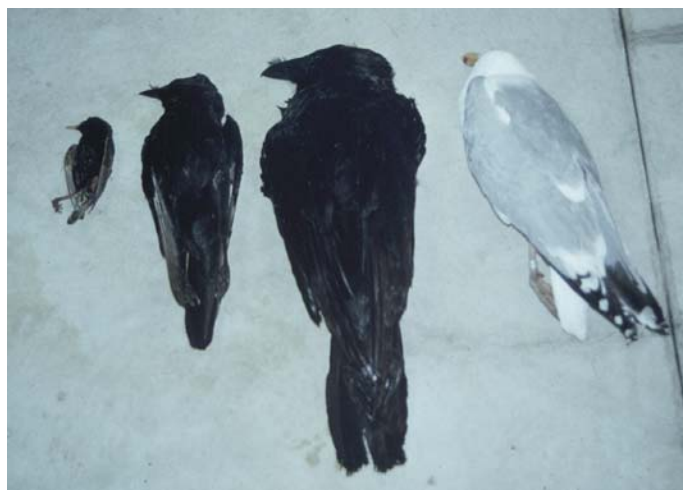
Figure 3: Starling, Crow, Raven & Herring Gull

Investigations determined that on Friday, April 14 th , a cannister had exploded at the St. John's municipal landfill site (Robin Hood Bay) due to the action of the landfill's compactor. The fluid that hit the compactor and accompanying bulldozer was, according to the equipment operators, orange-yellow and smelled noxious. These employees washed down the equipment and worked elsewhere on the site for the remainder of the day. No samples were available for analysis from the equipment or the cannister as it was buried.