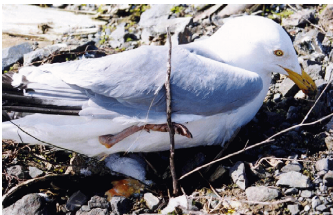
Figure 1: Sick Herring Gull

On Saturday, April 15 th , 2000 reports were received from numerous sources of sick and dead herring gulls (Figure 1) around a city lake (Quidi Vidi Lake, see Figure 2). Symptoms included vomiting, lethargy, drooped wings, paralysis and in some cases very alert birds that could not control their body movement but would defend themselves with their beaks.