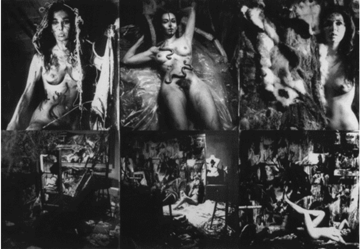
Figure 1 Carolee Schneemann, Eye Body: 36 Transformative Actions , 1963. Photographs by Erró.

Reproduced from “Eye Body: 36 Transformative Actions 1963,” Carolee Schneemann, http://www.caroleeschneemann.com .