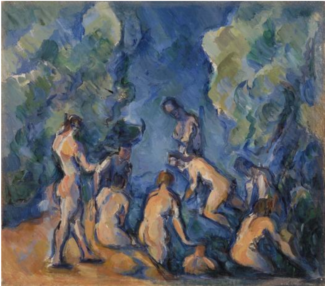
Figure 8 Paul Cézanne, Bathers , 1902-1904, oil on canvas, 9 3/8 x 10 11/16 inches.