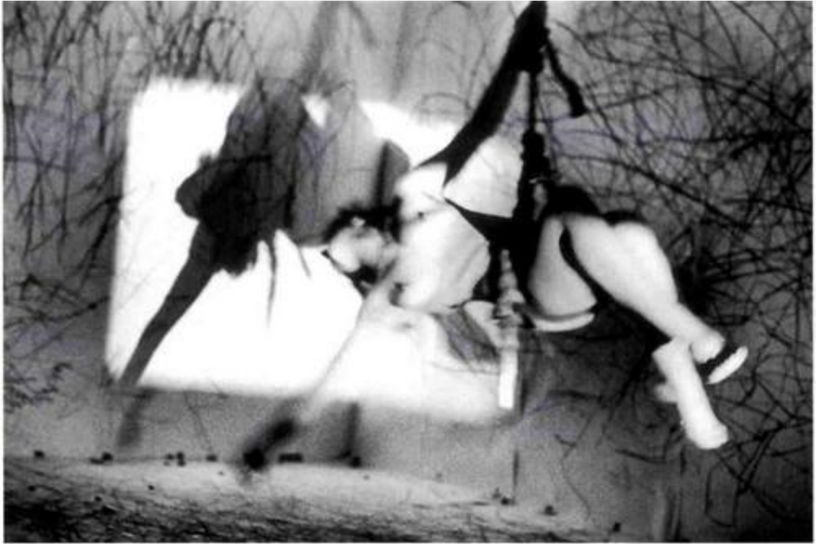
Figure 14 Carolee Schneemann, Up to and Including Her Limits , 1973-1976

Reproduced from "Carolee Schneemann, Up to and Including Her Limits," http://www.artperformance.org .