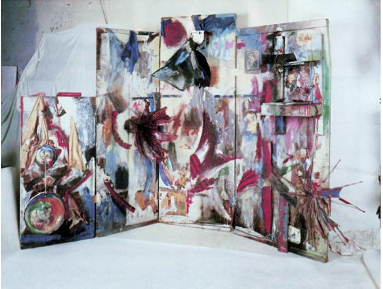
Figure 12 Carolee Schneemann, Four Fur Cutting Boards , 1963, mixed media, 52 ½ x46 inches.