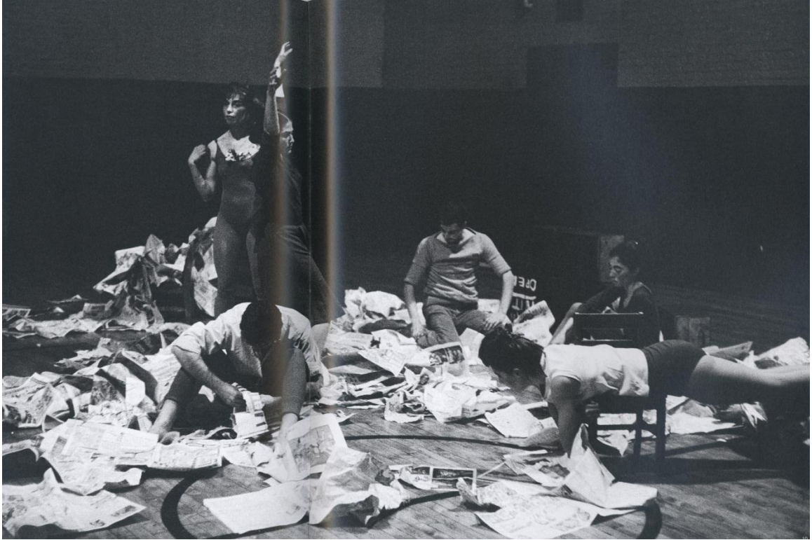
Figure 7 Carolee Schneemann, Newspaper Event , 1963.