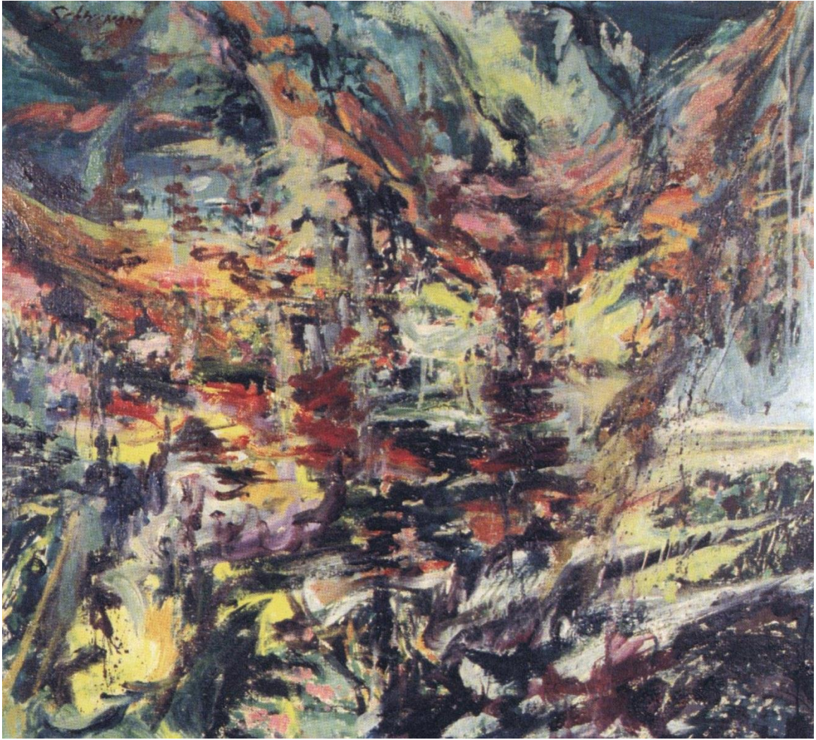
Figure 6 Carolee Schneemann, Landscape , 1959, oil on canvas, 32x35 inches.

Reproduced from Schneemann, Carolee. Up To and Including Her Limits . New York: The New Museum of Contemporary Art, 1997.