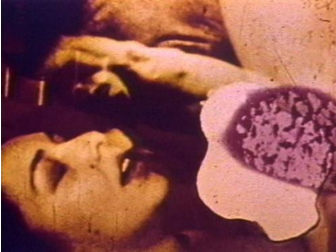
Figure 3 Carolee Schneemann, Fuses , 1964-66, 16 mm film, 18 min.