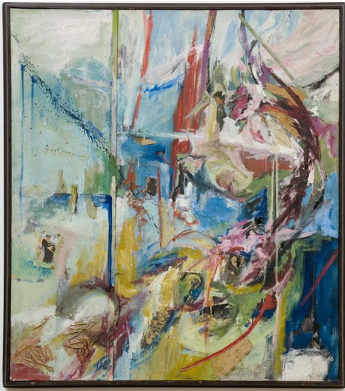
Figure 10 Carolee Schneemann, Tenebration , 1961, mixed media, 52 ½ x 46 inches.