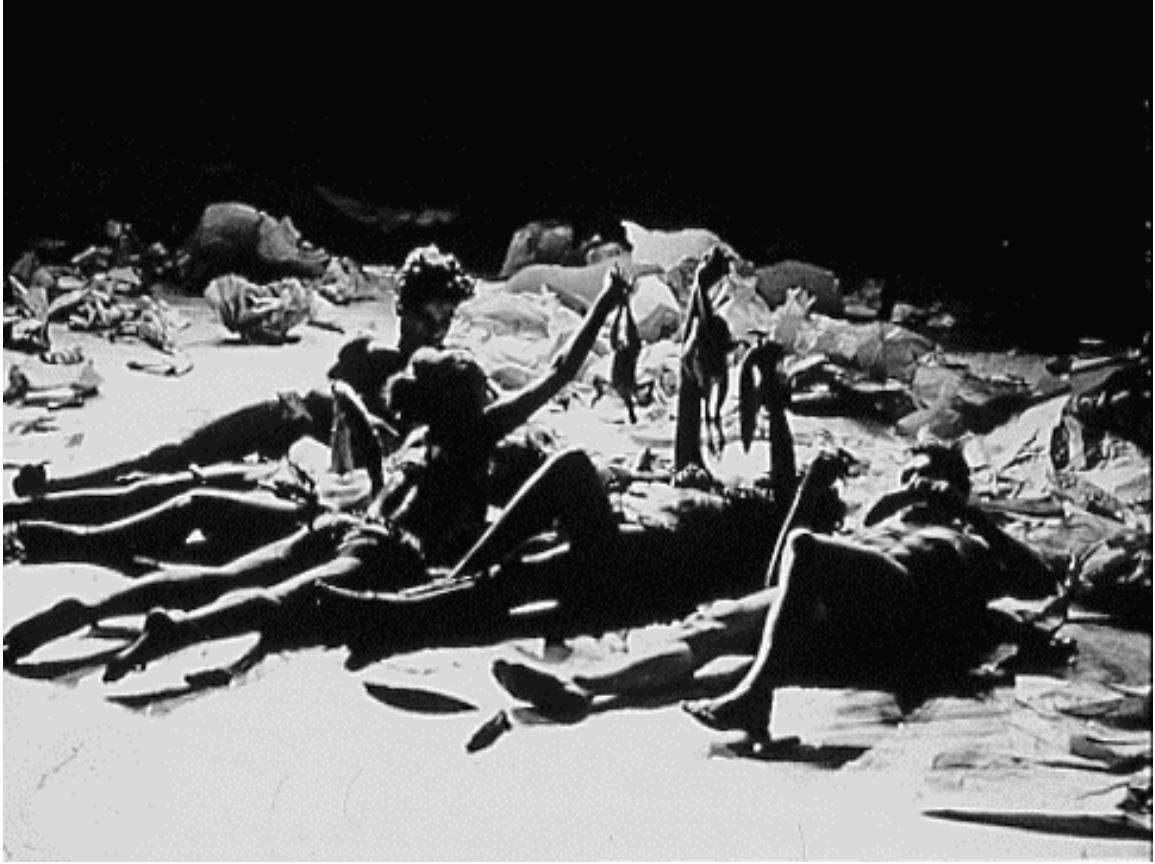
Figure 2 Carolee Schneemann, Meat Joy , 1964.

Reproduced from "Meat Joy 1964," Carolee Schneemann, http://www.caroleeschneemann.com .