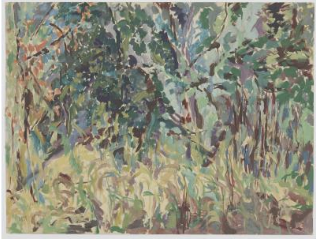
Figure 5 Carolee Schneemann, Untitled, October 1959 , oil on paper, 20 x 26 inches.