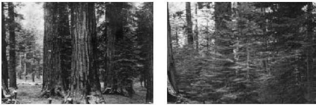
Photos showing an example of the same stand of mixed-conifer forest and giant sequoias in the Mariposa Grove, Yosemite National Park before (1890s) and after (1970s) fire exclusion.

Forest structure has shifted substantially from what it was a hundred years ago and many forests are now at high risk for stand-replacing wildfire. Forests have become choked with smaller, fire-prone species of trees that serve as “ladders” to the overstory canopy, increasing the risk of crown fires; they have large accumulations of litter than can burn hot and easily kill older, otherwise healthy trees; and the smaller, fire-prone trees are typically not of much financial value.