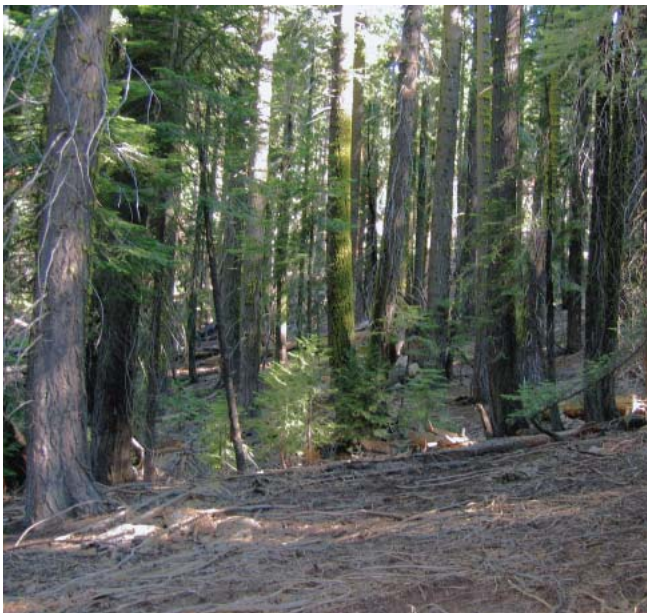
Fire-excluded stand at Teakettle.

Another intriguing result relates to water. Researchers found that water is the primary influence on ecosystem function in mixed-conifer forests. This included tree regeneration, nutrient cycling, decomposition, and understory diversity. Water in the Sierra Nevada is scarce during the summer months, and forests rely on the previous winter's snow to provide almost all of the soil moisture. In fire-excluded stands, with many small trees competing for limited soil moisture, water was usually the limiting factor for many ecological processes. Thinning significantly reduced the number of small trees increasing water availability. However the forest only benefited from this increase in water if fire was applied to remove slash and thick litter layers which otherwise slow recovery.