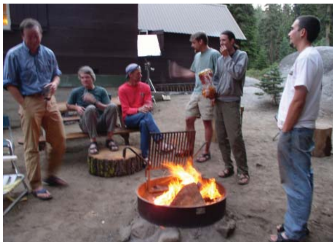
Scientists enjoying the collaboration and inquiry common to their research interests at Teakettle.

Working together, Teakettles' researchers examined everything from nutrient cycling, to invertebrates, to plants, to nitrogen, to soil respiration, to decomposition and more. The intense focus in one place and coordinated sampling provides a more complete understanding of how fire and thinning fuels treatments, affect a complex web of processes within a forest. Although working at just one location, the combined insights from Teakettle may be widely applicable in other forests.