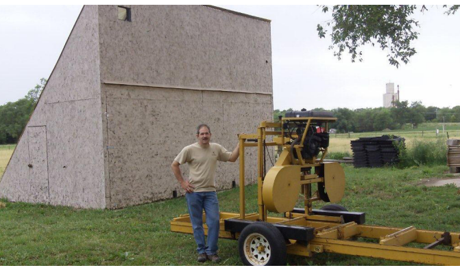
band sawmill, which he built Ron with band sawmill and solar kiln.

The distribution of chiggers in any area is extremely spotty. Chiggers tend to congregate in patches, while nearby spots of apparently suitable living space is free of them. Of-