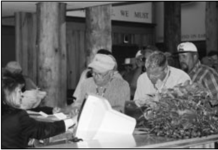
Waiting to fill-out room registrations at Arbor Day Farm's Lied Conference Center in Nebraska City.