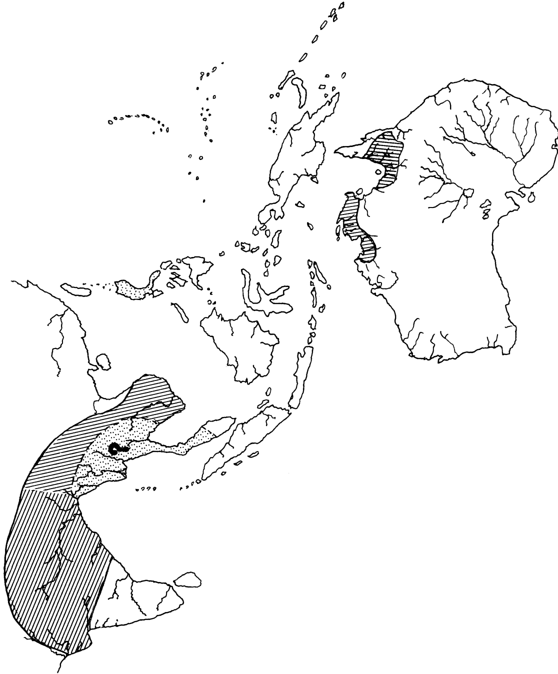
Residential distributions of the Indian (diagonal hatching) and Burmese (vertical hatching) sarus cranes. Areas of light stippling indicate regions of prior or uncertain occurrence.