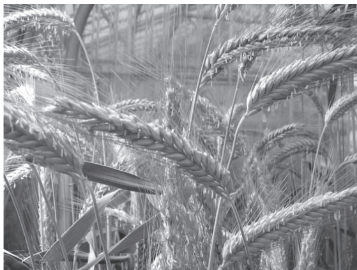
Triticale heads in the greenhouse. Triticale is planted and harvested like most small grains and is closest in appearance to winter wheat.

We had three experiments to address our objectives. The first two experiments consisted of 26 experimental triticale strains, three released triticale cultivars and one wheat cultivar, for comparison (winter wheat is the primary winter cereal grown in the U.S.). These two experiments were to assess the strains for both forage yield and quality, and grain yield. The two experiments were necessary because measurement of forage yield and quality is a destructive procedure, so we needed a second experiment to assess grain yield at maturity. In the third experiment we used