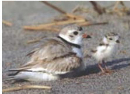
Piping Plover and chick.

Stone Harbor Point: Stone Harbor Point hosts one of the largest concentrations of beach nesting birds in the state. Feral cats, raccoons, and Laughing Gulls were