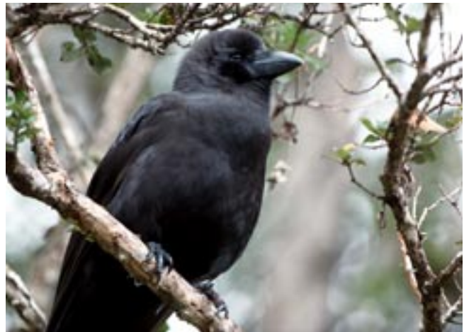
The 'Alala, or Hawaiian Crow, is the world's most endangered corvid. Populations of 'Alala have been decimated by introduced cats, rats, and other non-native predators.

captive-raised juveniles were released at McCandless Ranch. Of these, 21 died in the wild and six were recaptured and returned to the captive flock. Currently, no individuals are known to exist in the wild. There are currently 51 'Alala in captivity. Continued captive propagation of the 'Alala is required for its recovery. After the election of an appropriate release site, feral ungulates, rats and cats will have to be removed before re-introduction of 'Alala.