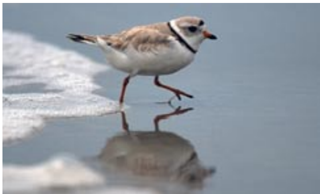
Piping Plovers are at risk from free-ranging and feral cats in New York.

From Jones Beach State Park to Westhampton Dunes, Long Island, there are thousands of unwanted cats and few places to put them. Animal shelters in Nassau and Suffolk counties already overflow with pet cats and kittens. A number of volunteers try to manage the stray and feral cat crisis by TNR. In 2002, biologists with the New York State Department of Environmental Conservation contended that a feral cat colony at Cedar Beach near Mount Sinai frightened off a formerly thriving population of nesting Piping Plovers. A 2002 survey by the New York State Department of Parks found that Long Island has more parks reporting feral cats than other regions in the state.