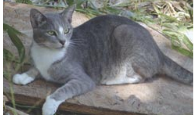
Feral and free-ranging cats will kill birds, even if the cats are well-fed.

Archbold Biological Station, Highlands County: The Florida Scrub-Jay is the only bird species found exclusively in Florida, and its population has declined by at least 25% since 1983 to approximately 8,000–10,000 individuals. The Florida Scrub-Jay was federally listed as Threatened in 1987 primarily because of habitat fragmentation, degradation and loss. It is also state-listed as Threatened. The Florida Scrub-Jay has been extirpated from Alachua, Broward, Dade, Duval, Pinellas, and St. Johns counties. Currently many populations of scrub-jays are small and isolated. More than half of the remaining birds occur on or around two large tracts of land: Ocala National Forest** and Merritt Island National Wildlife Refuge**. The USFWS