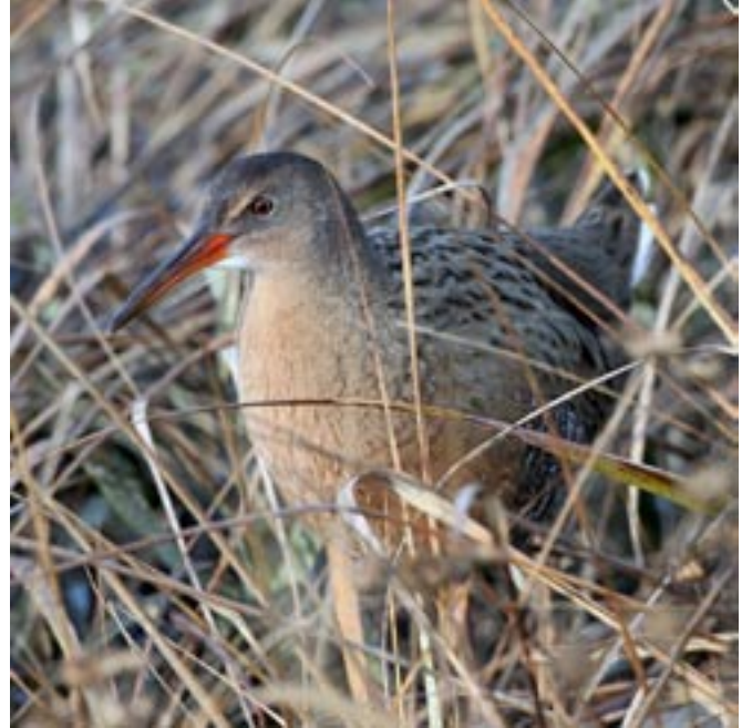
The federally-listed California Clapper Rail is a ground-nesting species that is especially vulnerable to cat predation.

Golden Gate Park, San Francisco: Twenty years ago, cats in San Francisco's Golden Gate Park were routinely removed, and California Quail were numerous. However, in the early 1990s, animal rights activists objected to the euthanasia of stray and feral cats trapped in the park. At the same time, underbrush was cleared from some areas of the park to discourage homeless people. As a result, the once abundant California Quail has all but disappeared from Golden Gate and other city parks. The city's Commission on the Environment passed a resolution in July 2000 to designate the California Quail as the official city bird. However, the resolution also specifies that quail restoration must be