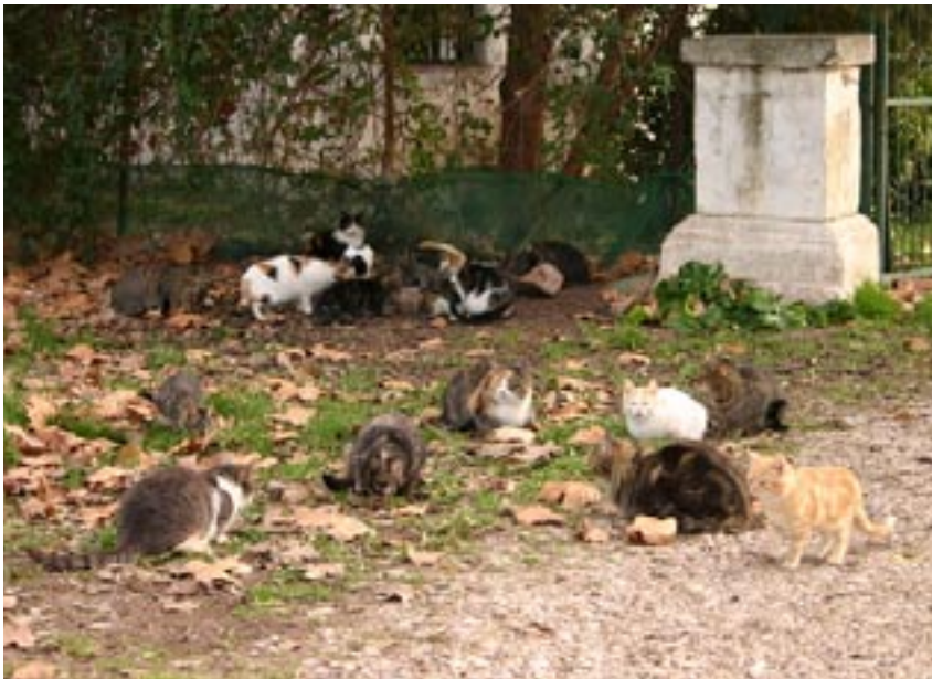
Managed cat colonies, a result of trap/neuter/release programs, do not save cats from the many hazards of living outdoors. Free-roaming cats are constantly at risk from injury, disease, and predation.

TNR may violate federal and state wildlife protection laws. In 2002, the U.S. Fish and Wildlife Service (USFWS) commissioned the Conservation Clinic of the Levin College of Law at the University of Florida to analyze and compare federal, state, and local laws as they pertain to managed cat colonies. The report, Feral Cat Colonies in Florida: The Fur and Feathers are Flying ( http://www.law.ufl.edu/conservation/pdf/feralcat.pdf ), concluded that federal and state wildlife laws designed to protect endangered and threatened species conflict with the practice of releasing non-indigenous predators into the wild. Specifically, TNR practices likely violate the Endangered Species Act (ESA) and the Migratory Bird Treaty Act (MBTA), because they may result in the direct take of protected species. In addition, the review found that local governments that enact ordinances to legalize TNR may be found in violation of these laws if cats in legalized colonies kill or harass protected species.