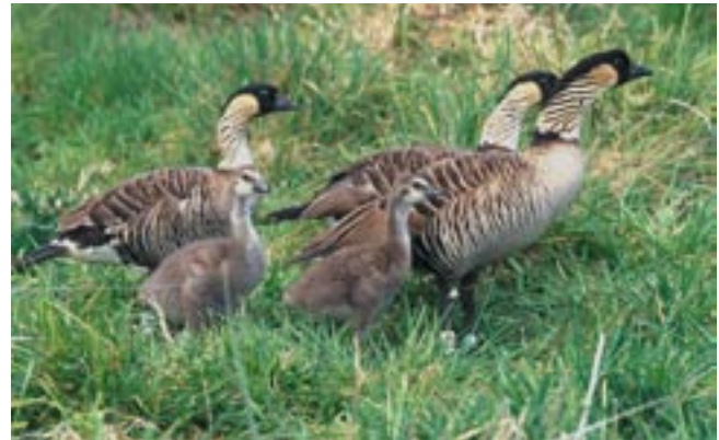
The Nene, or Hawaiian Goose, is federally listed as Endangered. Nenes are threatened by feral cats and other predators, which prey upon their eggs and young.

The introduction of alien predators, including cats, has had a documented negative impact on populations of four endangered waterbirds: Hawaiian Coot, Hawaiian Duck, Hawaiian Moorhen, and Hawaiian Stilt. The proliferation of feral cat feeding stations near parks and other areas that support waterbirds may have a significant effect on waterbird recovery in these areas. The extirpation of Laysan Ducks from the main Hawaiian Islands probably occurred 1,500 years ago due to harmful predators, human exploitation, and habitat loss. The disappearance of the Laysan Duck is coincidental with the appearance of rats in the chronological subfossil record. Although not currently a problem on Laysan Island, mammalian predators pose the greatest direct threat to the recovery of the species. Laysan Duck will require reestablishment of the species on at least some of the Main Hawaiian Islands, nearly all of which are inhabited by rats, cats, dogs, mice, pigs, and mongoose. Laysan Ducks are incapable of flight during their annual molt, and they also tend to run or freeze in place rather than fly as an escape response, which makes them highly susceptible to predators. Cats are now the only mammalian predator on