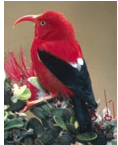
The 'I'iwi, or Hawaiian Honeycreeper.

The 2003 Draft Revised Recovery Plan for Hawaiian Forest Birds states that the introduction of alien mammals, such as rats, feral cats, and the small Indian mongoose, has severely impacted populations of native forest birds. Control of these alien predators is required for forest bird recovery. However, predator control efforts thus far generally have not been conducted over areas large enough to result in significant improvement in the status of a species, subspecies, or distinct local population. Research priorities for most Hawaiian forest birds include developing improved methods for controlling rats and feral cats in native forests.