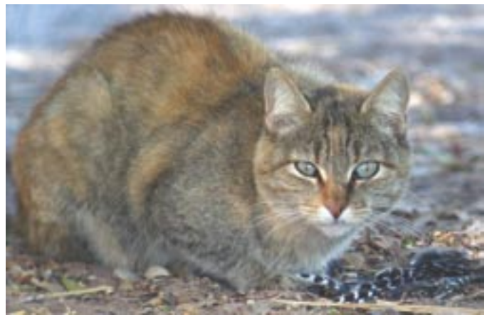
Feral and free-ranging cats account for millions of bird deaths each year, including threatened and endangered species.

San Clemente Island**: This island has two federally-listed subspecies of birds found only on the island: the San Clemente Loggerhead Shrike, one of the rarest birds in North America, and the San Clemente Sage