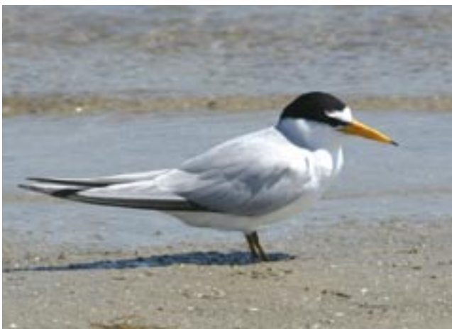
Feral and free-roaming cats prey on adult Least Terns, as well as their eggs and chicks. Constant predation may force terns to abandon nest sites and entire colonies.

In 2002, only one pair of plovers nested at the site, resulting in two nesting attempts. Both nests failed to hatch. The first nest was predated, and the second nest was abandoned. Cats are a serious concern in this area, but it is not known whether pet or feral cats are the problem.