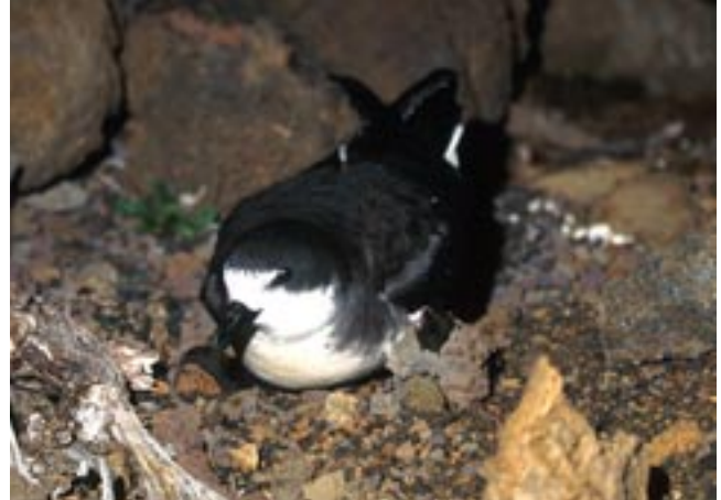
The Hawaiian Petrel, or ‘Ua‘u, has no effective defenses against cats and other non-native predators.

Kaua‘i, Hawaii, Moloka‘i, and Lehua: Approximately 75% of the federally threatened ‘A‘o, or Newell’s Shearwater, nest on Kauai, and indications are that