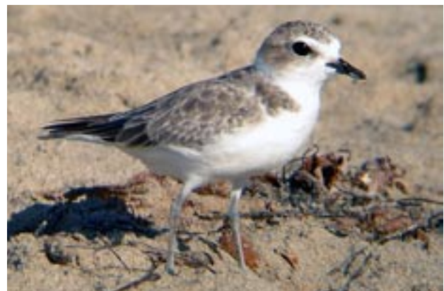
The Western Snowy Plover is only one of many threatened bird species in California at risk from cat predation.

San Pablo Bay Wetlands,* Marin/Sonoma/Napa/Solano Counties: California Black Rail, California Clapper Rail, Western Snowy Plover.