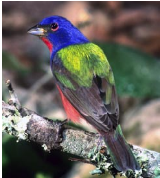
The Painted Bunting is an ABC Green List species at risk from feral and free-ranging cats in Florida.

In a Florida International University study, two managed cat colonies in Miami-Dade County (Crandon Marina and A.D. Barnes Park) were observed for 13 months. The number of cats in each colony remained relatively stable (with 91 cats at Crandon and 37 cats at Barnes), but the population dynamics changed. Almost every month, some cats disappeared and new cats joined the colonies. Adult cats and kittens were abandoned at each park during the study, despite state and county laws prohibiting pet abandonment. Cats that had not been spayed or neutered were observed at both sites, and some were not trapped for several months. Other cats were never captured. At Crandon, several females became pregnant and two of them gave birth in the park. Aggressive interactions among colony cats were few and mostly limited to the commencement of feeding. After the majority of cats fed, cats on the outskirts would eat, contrasting with the notion that