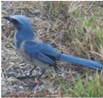
Florida Scrub-Jay.

TNR in Florida: Some counties, such as Palm Beach and Brevard, have amended their ordinances to allow cat colonies if the colony is registered with a desig-