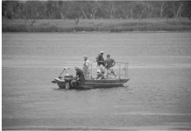
Researchers inject a non-toxic, traceable dye into Lake Ogallala. The dye was used to help track water flow patterns in the lake, part of an interdisciplinary study aimed at solving the lake's periodically low levels of dissolved oxygen which may contribute to fish kills in the popular trout fishing lake.

The research is being funded by grants from the Nebraska Game and Parks Commission through NU's Institute of Agriculture and Natural Resources and Agricultural Research Division.