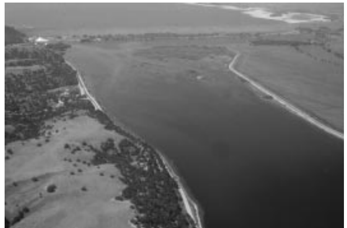
An interdisciplinary research team is trying to identify and solve fish kill problems in Lake Ogallala that may be related to periodically low levels of dissolved oxygen in the lake. This view of the lake looks toward Kingsley Dam and Lake McConaughy.

Last summer, researchers intensively sampled the lake's water from four testing platforms on the lake and from 30 underwater sampling sites. Lake McConaughy sampling sites provided references to determine the quality of water entering Lake Ogallala.